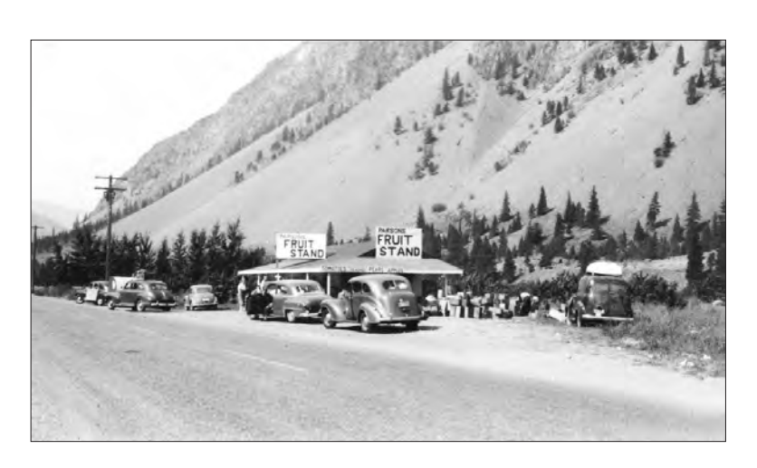
Fig. 1 Bob Parsons' fruit stand and Highway 3 at Keremeos, ca. 1954.

Two photographs show Bob Parsons' fruit stand from a similar vantage point in different years during the mid 1950s; Figure 1 is the earlier of the two. The stand's core structure was a timber-frame building roughly 3.5 m x 3.6 m (12 x 14 ft) in size with a relatively low-pitched roof and no gutters.14 (By this time, the building was substantially larger than the original.) Its southern and eastern (sunward) facades were shaded by a low overhanging roof that extended approximately 6 feet (183 cm) beyond the core structure and was supported by posts around its perimeter. Beneath this overhang or canopy was a low wooden platform which raised the produce above the dusty, unpaved parking area. The depth of the overhang on Bob Parsons' stand and the fact that its east-facing roof would soon be extended even further emphasizes how much the sun's summer trajectory influenced the layout of produce stands. The fruit on display was usually quite ripe and required protection from the sun's rays. More shade allowed more produce to be kept at hand, ready to restock shelves or fill large orders. 15 When sales were good enough for a stand operator to expand, expansion more often than not took the form of extending a roofline or canopy rather than enlarging the walled building. Many fruit stands had the greater part of their total footprint located "outside," open to the air while protected from sun and rain.