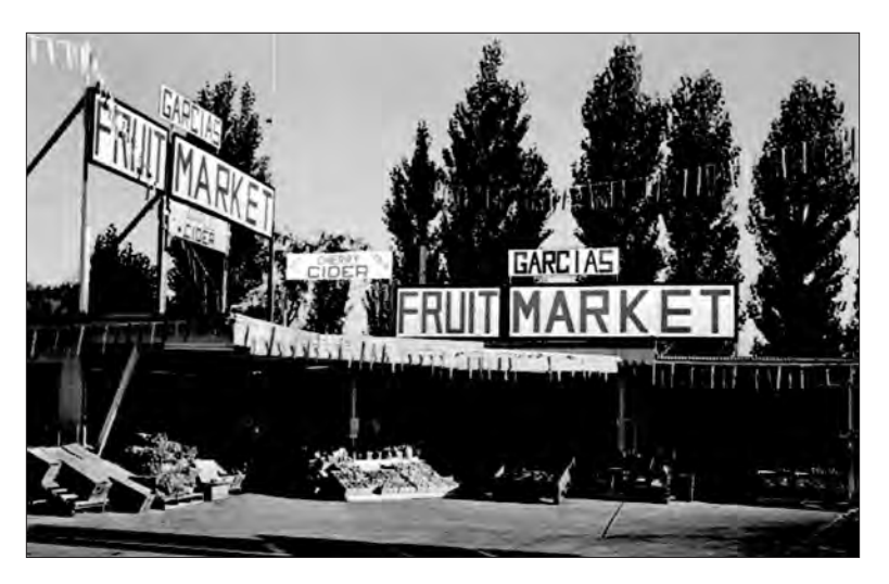
Fig. 7 Garcias fruit stand, formerly Fernandes, Osoyoos, ca. 1970.

new sign proudly identified the fruit stand and its produce as "Fernandes' Own."