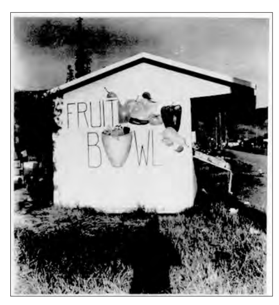
Fig. 2 and 3 Doug Parsons' fruit stand as seen by eastbound and westbound motorists, Keremeos, ca. 1952.

Doug Parsons named his stand the Fruit Bowl to differentiate it from other stands. It is quite typical of early stands. The footprint was approximately 2.1 x 3 m (7 x 10 ft.) with a roof extension projecting over the facade by approximately 1 m (3 ft.) The walls were likely framed using 2x4s and faced with plywood. Here again the location on the roadside and the trajectory of the sun were crucial factors in the design of the stand. Set approximately 3.6 m (12 ft) back from the road surface, the south-facing facade was exposed to the sun all day. Openings were cut into the south and east facades, with hinged flaps attached along the bottom edge. Being able to open up two sides of the stand encouraged air circulation, which gave some respite from the heat for both operator and produce. The low, flat-pitched roof reduced heat absorption, while the overhang and skirting attached to its edge helped protect the fruit on display from the glare