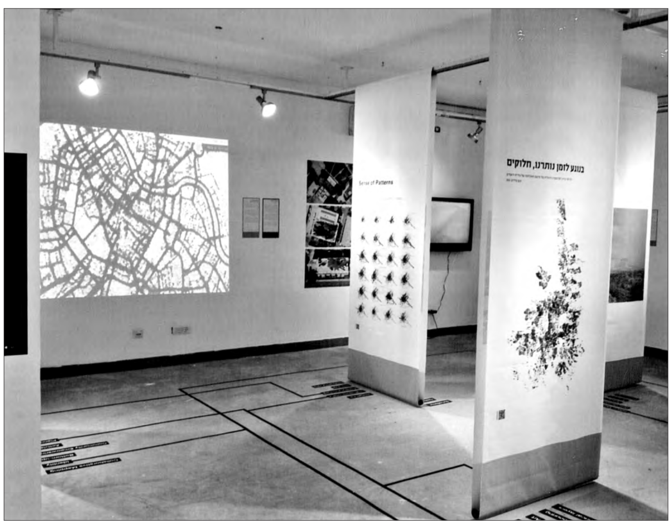
Fig. 1 (opposite) and Fig. 2: (below) Glimpses into the space of the exhibition.

The exhibition, in which a variety of mapping practices are meaningfully examined, highlights the materiality of the unseen in both the global East and the global South. This point is important in showing the multiplicity of places and contexts in which the unseen, or the Other, has been constructed so far. No less important is that by measuring, quantifying and visualizing the data,