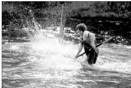
Fig. 6 Splashing the water to move the fish into the trap.