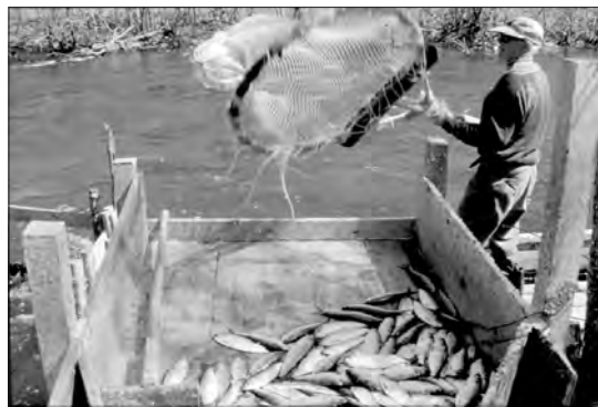
Fig. 7 Dip net used to take fish from the sluice trap.

The wooden posts were about 2 metres long and were held in place by long thin black spruce poles. These constituted the infrastructure used to hold the trap correctly in the river. The sluice trap itself was a wooden rectangular box with one side lining up with the river shore. The sides of the box were wooden boards on a pole frame and held in the river by posts driven into the river bottom. Depending on the width of the river and the preference of the fishers, the trap measured 3 to 4 metres in length, about 1 metre in width,