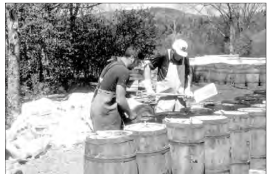
Fig. 10 (opposite) Adding salt to pickling barrels.

The barrels of gaspereau were then hauled to Kenloch, where they were loaded onto a train to be shipped to Pier 21 in Halifax. “Geez, I was amazed. Thousands of barrels, right? From all over. And it wasn’t just gaspereau, like, there [were] other kinds of fish.... The smell, you get the smell of the fish” (Gillis 2009). Since the 1960s, the fish were packed in twenty-kilogram pails.