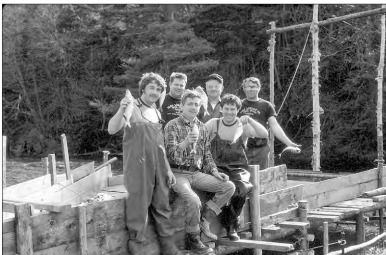
Fig. 9 Men in amusing pose holding fish.

Occasionally salmon and trout are caught in the trap. Even a beaver once ventured into the Peters' trap: "I almost caught a beaver. He got in the trap and he banged at the gate, and then he