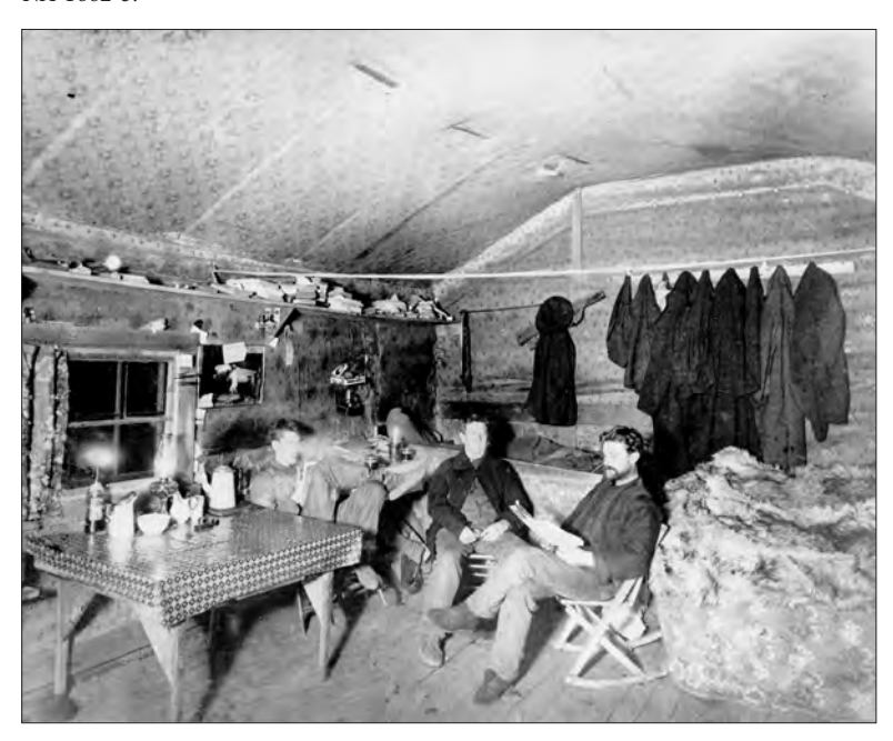
Fig. 5 A gold miner's papered cabin, 1901. The floral and vine pattern fills this communal space with domesticity. The conveyances to bring this paper to the Yukon gold fields may have included rail across the Panamanian isthmus, clipper ship around the Cape of Good Hope, and passage in a smaller vessel from San Francisco. Vancouver Public Library, 64.

Textiles (1918), named wallpaper as a decorative art, albeit a minor one. Nancy McClelland's scholarly Historic Wall-Papers: From Their Inception to the Introduction of Machinery (1924) also placed wallpaper among the decorative arts. More important than her book's title may have been the subtitle. Machinery was judged by McClelland as a degradation from block printing. Henri Clouzot's introduction was even more disparaging toward production by machine: