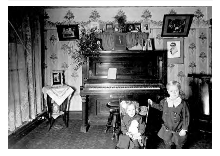
Fig. 7 (top)

The members of this wedding party (Vancouver, 1890) are awash in pattern. Decoration was not only for walls and ceilings; it also appeared on doors and picture frames on special occasions.