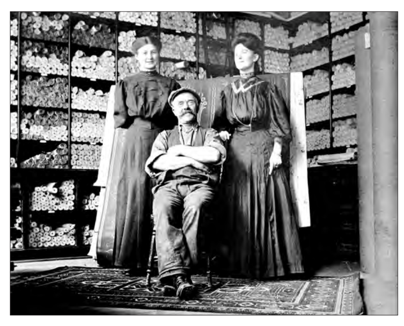
(Hoskins 2005: 7)

France has excellent collections of the high-quality luxury products ... but the study of them in situ is limited compared with the United States of America where the use of such material, in combination with documentary sources, has resulted in a rich industrial and sociological history.