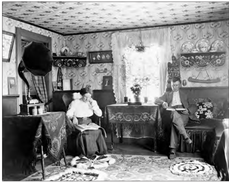
Fig. 2 (top) A room with rustic dado at the Cochrane ranch, Calgary, Alberta, 1886.