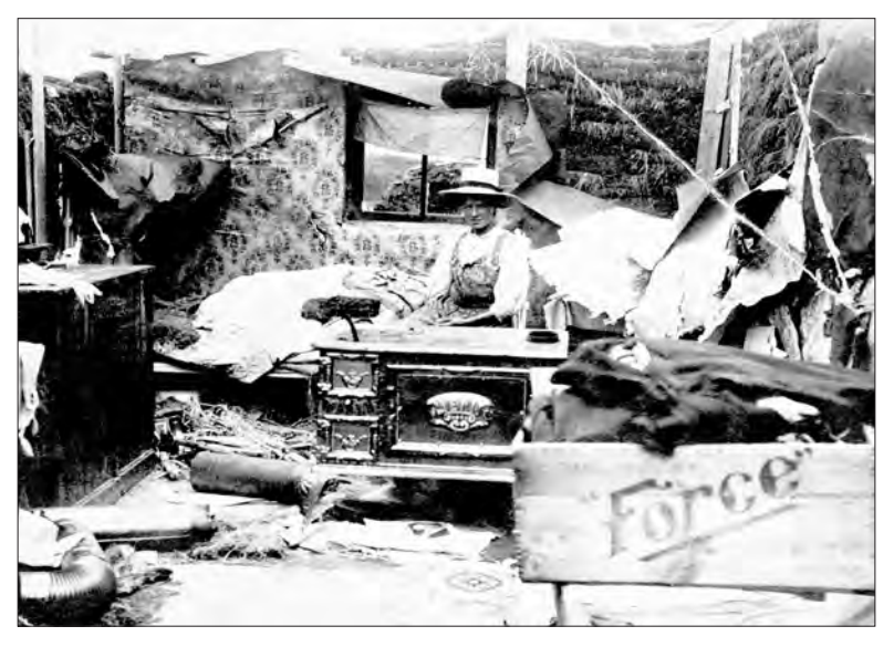
Fig. 4 (left) A papered sod house in Alberta after a tornado in the early 1900s. Glenbow Archives, NA-1662-5.

The American study of wallpaper began in 1908 with Kate Sanborn's sentimental Old Time Wall Papers . George Leland Hunter's series of magazine articles, later collected into Decorative