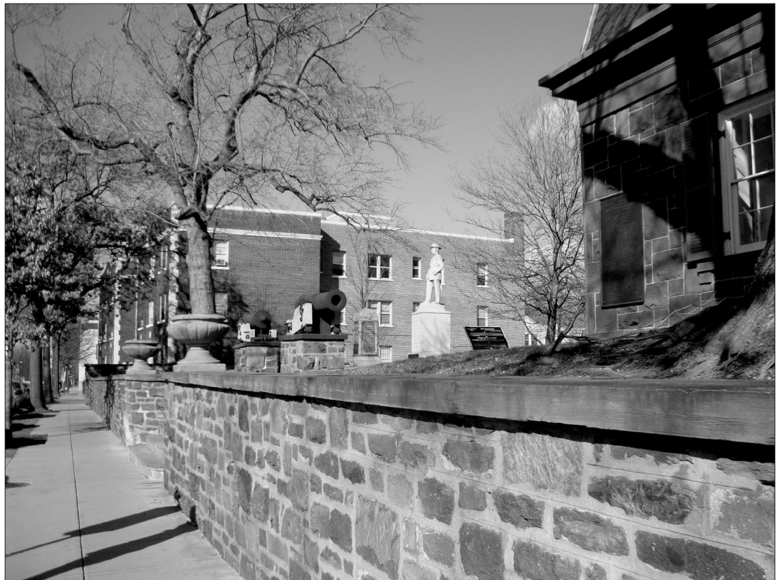
Fig. 6 The surroundings of Battleground National Cemetery are completely urbanized.

There are also characteristics of the site that mark it as distinctly federal. The red sandstone superintendent's lodge at Battleground National Cemetery (Fig. 7) utilizes a standardized design, a reflection of the Civil War's organizational legacy, a result of the need to move huge quantities of people and supplies across the country (Architrave 2004). Workers completed