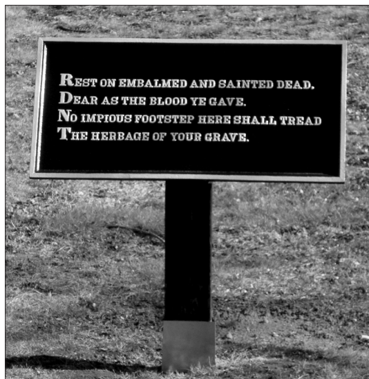
Fig. 5 Battleground National Cemetery: a placard excerpting Theodore O'Hara's Bivouac of the Dead.