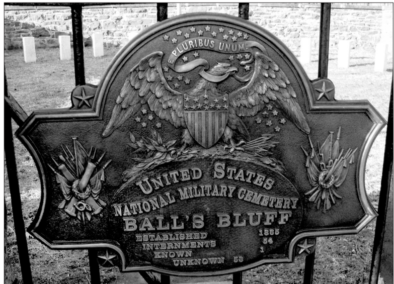
Fig. 2 An engraved plaque on the gate surrounding Ball's Bluff National Cemetery provides basic information.

With those near-immediate burials, the Union Army reshaped James Malloy’s orchard into another thing altogether—a national memorial. As Northern troops buried Northern dead, they froze that plot of land in a moment of Civil War time. The final burial of Campbell only strengthened that memory, though today the sprawl of development has changed its physical context dramatically and morphed the rural location into an urban one. The land today has been so wholly subdivided that the battlefield mostly lies beneath city streets and apartments buildings and is not visible from the cemetery. The physical relationship between the two has been forever lost, as has their geographical position atop Washington, DC, from which the White House was once easily visible. Though