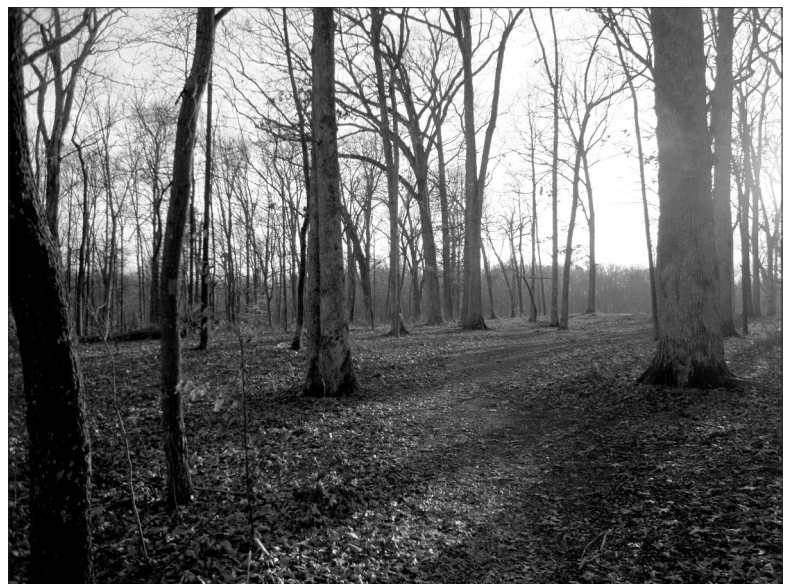
Fig. 10 Ball's Bluff National Battlefield is largely the same today as it was in 1861: serene.

Yet an occasional injection of federal money alone will not bring cultural meaning to a given