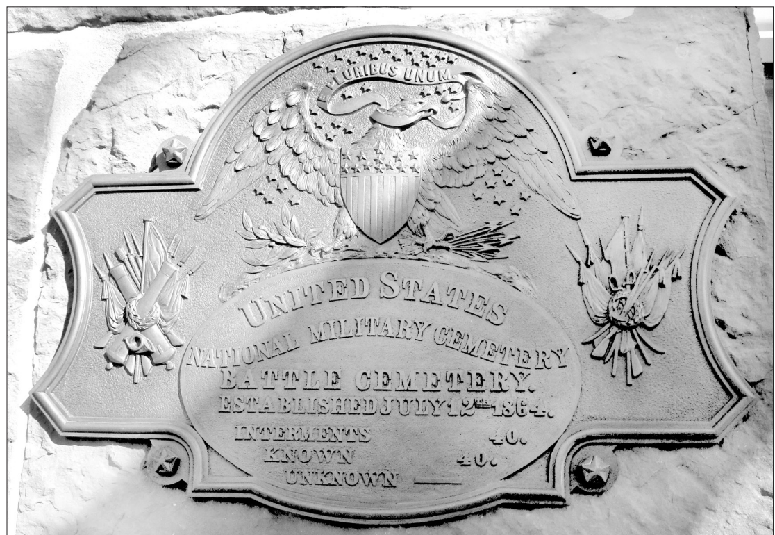
Fig. 1 An exterior wall of the Superintendent's Lodge at Battleground National Cemetery features a plaque of basic information.

Confederate (South) and Union (North) forces clashed in the Battle of Fort Stevens on July 11 and 12, 1864. Confederate Major General Jubal Early led an attack on the Fort Stevens fortifications in a bid to take the capital in what was to be the last of the great Confederate incursions into Union territory. Although Union leaders were disturbed by the intrusion into Washington, DC, and President Lincoln himself came under fire by Confederate sharpshooters, 1 Union Major Generals Alexander McDowell McCook and Horatio Gouverneur Wright repelled the effort with relatively little effort and minimal bloodshed. Once the skirmishing ended, the living had to attend to the dead. In wartime, initial burials were rushed acts of necessity, dictated by the urgency of burying the corpses that would soon create deadly vectors for disease. Frequently, captured prisoners of war and regiments from the Colored Troops were placed on burial detail, tasked with interring sometimes innumerable corpses of fallen soldiers, most of whom had died far from home.