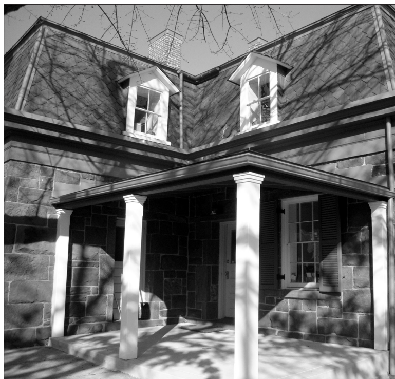
Fig. 7 The Superintendent's Lodge at Battleground National Cemetery was recently restored as part of a $1.2 million federal initiative.

Battleground National Cemetery cannot be called a genuine DC tourist destination by any stretch of the imagination. Of equal relevance, however, is the lack of effort on anyone’s part to market it as such. It appears as one stop on the Brightwood African American Heritage Trail of Cultural Tourism DC, a nonprofit organization. The city’s Chamber of Commerce and official tourism websites do not include entries on it, seemingly dwarfed as it is by the looming presence of Arlington National Cemetery just across the river. It is important to note that just as our collective view of the Civil War is not static, the cemetery itself has undergone changes over