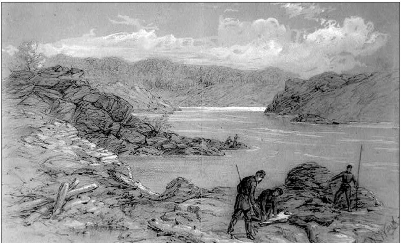
Fig. 8 Alfred Rudolph Waud's 1861 drawing Discovering the bodies of the slain in the Potomac river.

Much of the Civil War, in fact, retains a poignant presence in Virginia. Its sites are aggressively and successfully marketed as cultural assets and tourist destinations. The NVRPA maintains a strong online presence for Ball's Bluff (Northern Virginia Regional Park Authority 2014) and produced a 23-page Management Plan detailing goals and resource management strategies for the