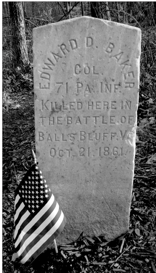
Fig. 3 A marker noting the spot at which Senator Edward Baker died during the Battle of Ball’s Bluff.