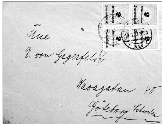
Fig. 1 Letter sent from Germany to Sweden, on November 19, 1923, during the German inflation period, franked with a total of 8 billion (“milliard”) German marks.

(2) A sociological motivation may be summarized as a desire to augment one's social status. Bourdieu demonstrated the link between the taste