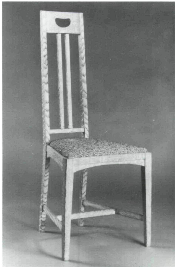
Fig. 4. Chair (height 106.6cm), oak, Scottish, ca. 1900-15. In the manner of Charles Rennie Mackintosh. Cat. no. 972.328.