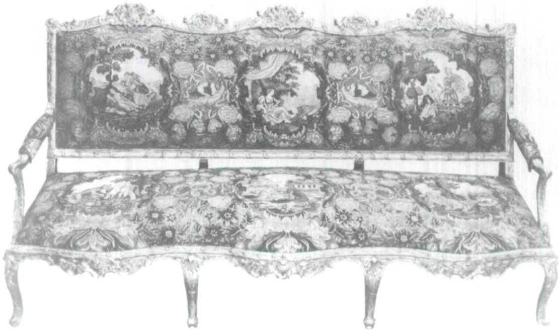
Fig. 2. Settee (length ca. 180cm), carved and gilt wood, scenes from Ovid's Metamorphoses on the back and from Aesop's Fables on the seat. Purchased by special subscription with the help of Mrs. Donald Early and other friends of the museum. Cat. no. 970.185c.

front desk, ca. 1775-80, by A.F. Delorme, a gift from the Larkin family, is the most important piece among the later French furniture. There is a serious shortage of Empire furniture in the collection and almost no Continental material to parallel the English Victorian era.