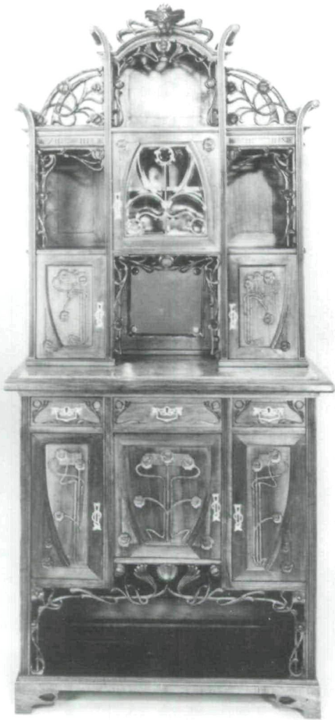
Fig. 3. Buffet (height ca. 250cm), European walnut case and veneer, brass hardware, bevelled and leaded glass door and mirror, probably Belgian, ca. 1900. Cat. no. 973.93a-c.