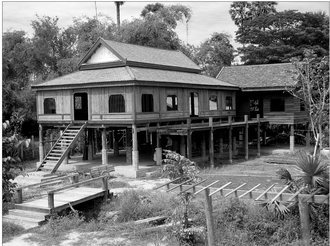
Fig. 8 The wooden house in Spean Chreav four months after the column raising ceremony.

projects and value both the aesthetics of a wooden house and its cultural significance to Cambodia's built environment. They also have the financial means to purchase land and build a house designed by an architect who works with highly skilled craftsmen. While some of their houses have been historic preservation projects, others have been new constructions that rely upon the designs and materials that are characteristic of the wooden house. These clients, however, are not interested in merely duplicating a house from the past, but expect modern upgrades that include indoor plumbing, electricity, septic systems, kitchen and bathroom counters, closets and even landscaping. Such demands require Hok Sokol and members of his architectural firm, HHH Company, to design innovations that are rooted in understanding the vernacular wooden house, while at the same time making it accessible to a current clientele. 14