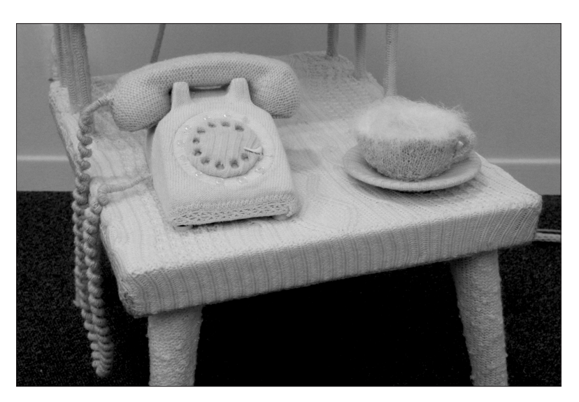
Fig. 7 Homage to Meret Oppenheim, 2000; artist: Janet Morton; photographer: Sarah Quinton.

"another manifestation of how women can be too selfless at times" (Patricia, thirty-two). Perhaps this indicates that the women approaching old age wished to "give back" to the community, to "make a difference" to the world and future generations through their actions. One of the mindsets occurring in this approach to old age, we propose, is the wish to transfer skills of the handmade; in this case the craft of knitting. This may be one of the reasons behind the frequent appearance of grandmothers in the interviews.