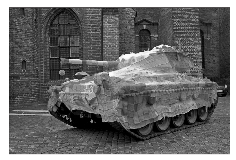
solace in the Doona, spiritual home of all Inner Nanas.

When you next receive an invite to a glamorous arts event, I urge you to decline and instead seek