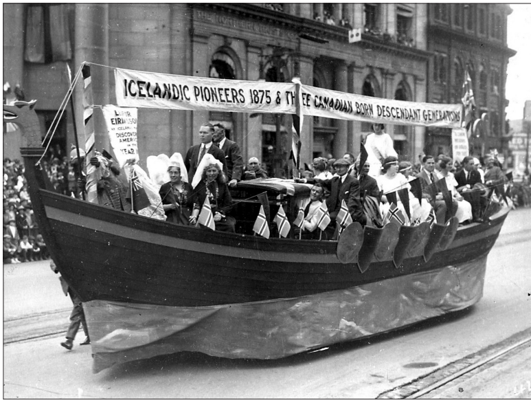
Fig. 2 Icelandic float at Winnipeg's 50th Anniversary parade, 1924.

Norse costumes, wigs and false beards in a depiction of the first meeting of the Icelandic parliament in 930 won first place at Winnipeg's celebration of Canada's Diamond Jubilee. The float informed spectators that Icelanders had not only discovered North America, but had also created the world's first representative parliament.