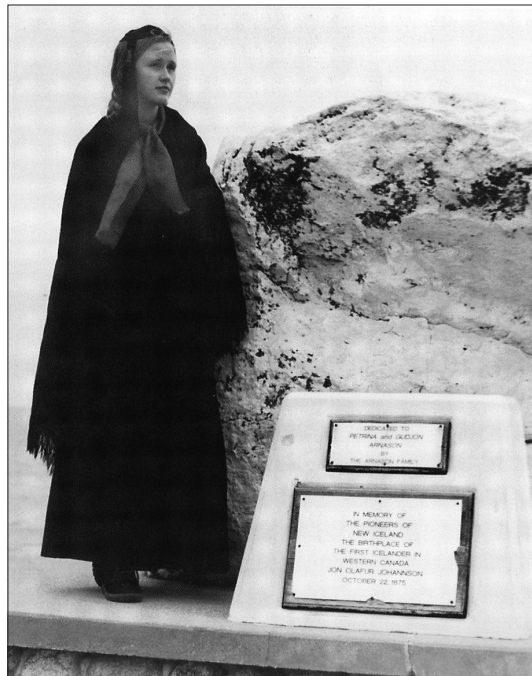
Fig. 9 Girl in Icelandic costume beside White Rock Monument.

At first glance, the decision of community members to retrieve previously "useless boxes" from barns, attics and basements following the creation of multiple visual campaigns celebrating the historical significance and emotional power of these objects, suggests a straightforward appropriation of the new images of the past set forth by heritage agencies. Yet, in this case, prescriptive images of the past and popular material cultural practice are divided on the issue of trauma. In keeping with the spectacles of migration set forth by agencies such as the Canadian Broadcasting Corporation and Canadian Museum of Civilization, public representations of the history of Icelandic communities encourage the identification and commemoration of hardship as a significant, but ultimately redemptive