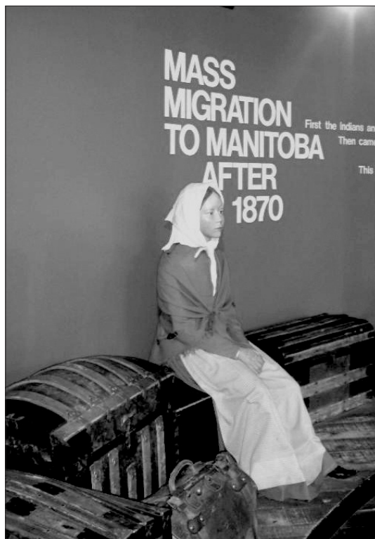
Fig. 5 Mass Migration to Manitoba gallery, Manitoba Museum.

Once shunned from the picturesque displays of the 1920s, trunks became a popular symbol of settlement history from the 1970s onwards. Centennial museum exhibits such as the Manitoba Museum's Mass Migration to Manitoba After 1870 used groupings of trunks as central motifs, as well as educational tools for exploring the role of mass migration as part of a larger chronology of nation building. Upon entering the gallery, visitors met the sole figure of a young immigrant woman seated on a trunk (Fig. 5). Her generic clothing concealed the mannequin's potential ethnic affiliations, since her shirt, shawl and headscarf were made from plain, un-hemmed, pieces of fabric pinned to her body. The display conveys a sense of isolation, poverty and anonymity while providing a generalized vision of arriving migrants. The personal hardship of migrants during transit was also an important component of the Canadian Museum of Civilization's Everyman's Heritage permanent