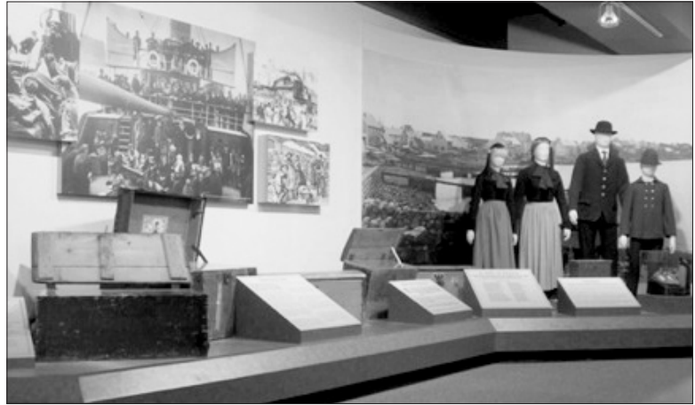
Fig. 6 New Iceland Heritage Museum Gallery in Gimli, Manitoba.

The low cultural value of the objects may be attributed to the decline of religiosity in the community. Migrants brought many religious books that would be of limited interest to more recent generations. More likely, however, Icelandic-language