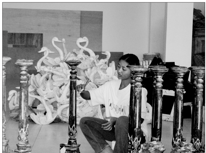
Fig. 3 An art shop worker applies a finishing coat of paint on wooden candle-holders.