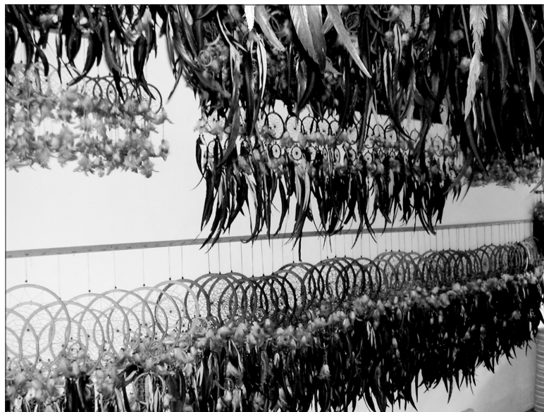
Fig. 1 Native American-style dreamcatchers.

ways in which Indonesian national culture has been reshaped, reimagined and sometimes invented for public consumption. From national theme parks (Errington 1998), the manipulation and commodification of burial rituals in Tana Toraja (Adams 1997; Yamashita 1994), to “primitive” woodcarvings by the minority Toba Bataks in northern Sumatra (Causey 2003), contemporary ethnographies on