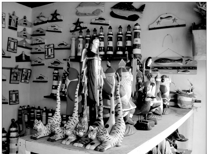
Fig. 4 Nautical themed "Cape Cod" decorations, along with wooden cats, Santa Claus and Hindu-inspired goddess statues at Tegallalang art shop.

The ability to source a variety of woodcarvings, to know what types of designs are popular among consumers abroad and to know the cultural significance of these objects is no easy feat. As art shops commonly source their materials from the same suppliers, their salespeople must find distinctive ways to draw in potential clients and convince customers that what they have to offer is better than their competitors. In other words, the more successful art shops in Tegallalang not only have to carry the right goods at attractive prices, but their art shop owners and employees feel that they must also demonstrate a worldliness and knowledge of the industry that is superior to the hundreds of other art shops along Tegallalang Main Street. The type