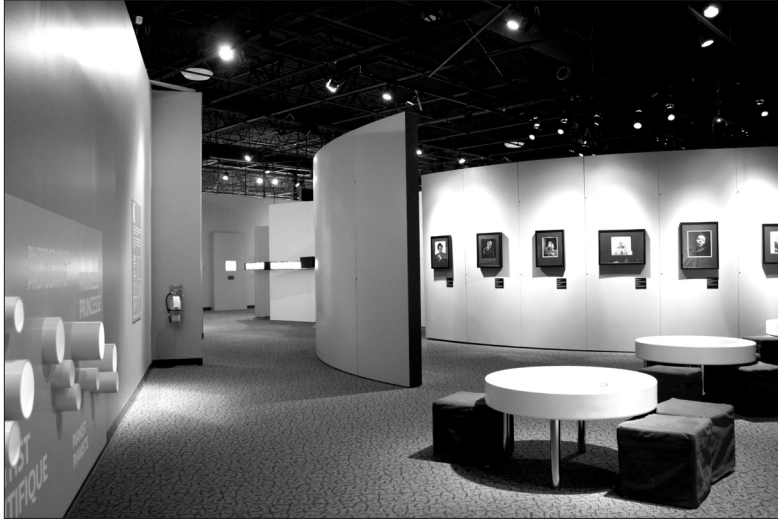
Fig. 10 Foyer-like area viewed towards the entrance/ exit.

My Karsh, the display showcases portraits taken by Karsh of people from the general public who responded to an invitation to upload their personal photographs onto the Festival Karsh website. 5 This section is small, but presents a fair selection of photographs that ultimately re-connects the viewer to a world composed primarily of ordinary people. It makes for a perfect ending to the effort of de-constructing the myth of Yousuf Karsh as a magician who captured the essence of his sitter in an unplanned moment in time.