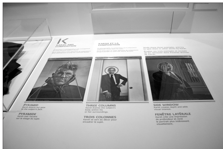
Fig. 7 Composition rules observed by Yousuf Karsh.

correctly, an additional explanation might have helped the inexperienced visitor better understand how the lights were used in the actual configuration of the studio (Fig. 6). Nonetheless, juxtaposing the lights on the dark room equipment leaves a metaphorical imprint of the practical story of how pictures are created by carefully balancing light and darkness.