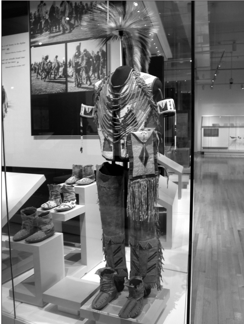
Fig. 3 Artifacts from the Edmund Morris Collection featured in the [ROM] Plains geocultural region exhibit case. Photo by the author; Gallery of Canada: First Peoples © Royal Ontario Museum, 2006. All rights reserved.

tend to focus on their own communities, involve local elders extensively in their programming and provide storage space for ceremonial items that community members may remove for use in the celebration of rituals, customs and sacred observances. In this context, dioramas are able to convey new understandings to audiences that may differ from those of urban mainstream museums. Informal conversations with Native acquaintances lead me to believe that it is also possible that, unlike the highly educated members of the Native arts and academic communities, at the local community level many Native people continue to be influenced by favourable impressions of dioramas from their childhood experiences of museums. Whereas critiques of anthropologists per se have been popularized within Native communities, critiques of museum anthropology in particular are still somewhat confined within academic circles.