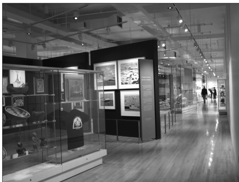
Fig. 4 The final section of the exhibit focuses on contemporary arts from paintings to pottery and T-shirts. Due to budget cuts, however, the length of the eastern wall remains empty of the "open storage" units planned by the curators. Photo by the author; Gallery of Canada: First Peoples © Royal Ontario Museum, 2006. All rights reserved.

Visitor D's suggestions also point to another interpretive framework that visitors bring with them to exhibits. She reminds us that some museum