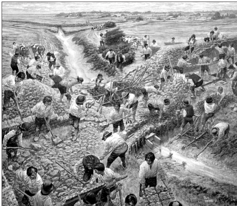
Fig. 2 Depiction of Acadian dyke construction at Grand-Pré by artist Lewis Parker.

Bleakney's analysis of dyke construction provides insights into how many people were needed to build or repair dykes. Obviously, those requirements were different for a tiny “pocket” marsh in the vicinity of Port Royal/Annapolis Royal than they were for the vast meadow at Grand-Pré. Tidal amplitudes also varied widely around the Bay of Fundy and the Minas Basin, which equally affected the height and base of the dykes that were required (Bleakney 2004: 11-19). 5 Bleakney