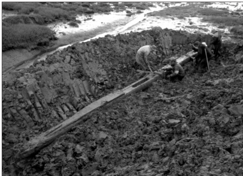
Fig. 3 Acadian sluice (or dalle) excavated near the Melanson Settlement National Historic Site.