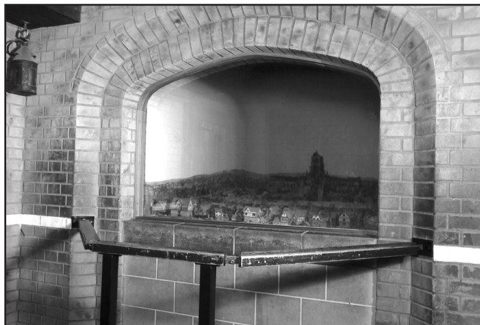
Fig. 2 The Great Fire Experience display case, courtesy of the Museum of London.

As Pepys' narrative progresses, the image of the darkened city begins to brighten as more and