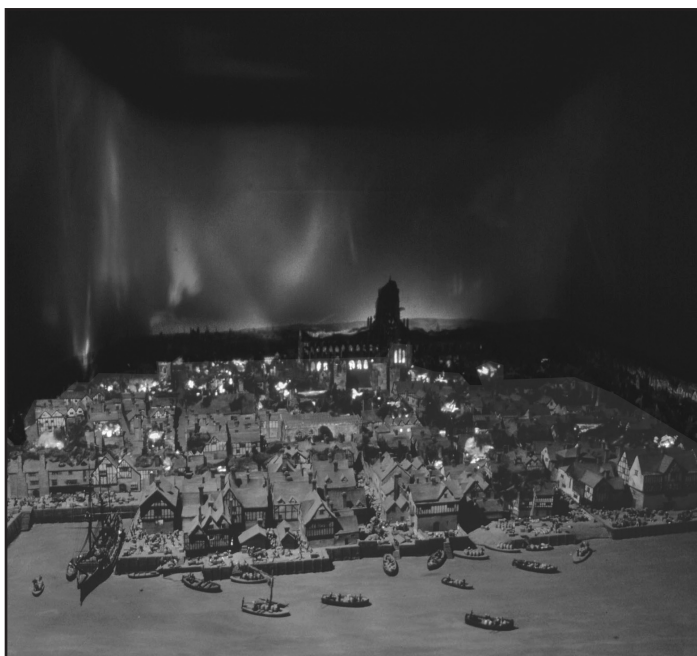
Fig. 3 The Great Fire Experience lit to represent the 1666 blaze, courtesy of the Museum of London.

more houses are burned. Red and yellow lights on areas of the model simulate flames (Fig. 3). The River Thames and St. Paul's Cathedral are two easily discernable landmarks on the model. On the wall behind the model, lighting effects create the appearance of dancing flames as London is reduced to the contents of Pepys's diary. As the fire rages, sound effects add strength to the sound of the wind and to the narrator's voice, including the crackling and popping of burning timbers. Explosions coincide with narration that describes the creation of firebreaks. Then, all is quiet and dark. After experiencing the terror of the city in flames, there is a pause that is followed by a second male narrator who informs the audience of the extent of the fire damage, that it devastated London and left many homeless. Guests exit through a separate, curtained