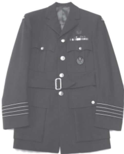
Fig. 1 This tailored barathea RCAF officer's winter service dress jacket from the 1950's (catalogue #1996.0688.1) includes both Flight Surgeon and Paratrooper qualification badges. The wearer was trained to accompany airborne troops into combat zones.

At the beginning of the Second World War, the standard issue working dress jacket for "other ranks" was designed with a fall collar and was worn buttoned to the neck. Officers could buy a special issue or have their jackets altered by a tailor to include an open collar so a tie could be worn. This