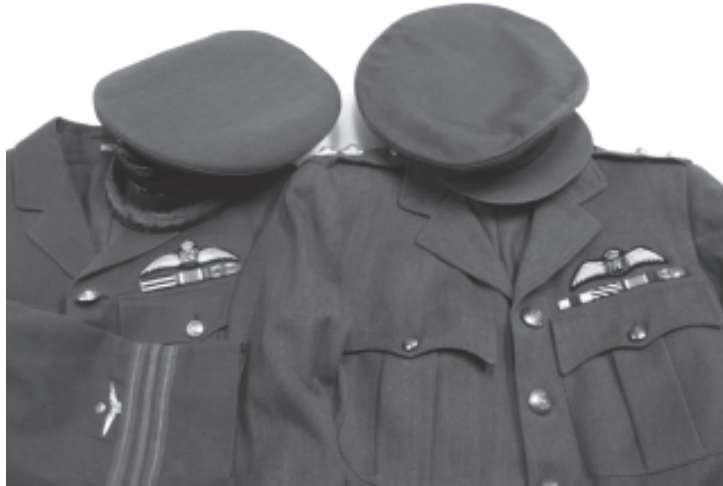
Fig. 5 The Royal Air Force uniform at left (jacket: catalogue #1998.0859.1; cap: 1998.0859.3) has a distinguishing crown and eagle above the rank braid on the sleeve. The uniform at right (jacket: 1988.0361.1; cap: 1998.0361.2) is that of a Canadian Army officer who was likely transferred or seconded to the RAF and earned his pilot's badge.

tion may have been the perception that as head of the navy, Churchill was attempting to create his own “private air force” in competition with the army and the RFC. The British government concluded that problems of coordination, competition and duplication could be eliminated by amalgamating the two services, so in 1918 it formed the RAF reporting to the newly created Air Ministry. 31