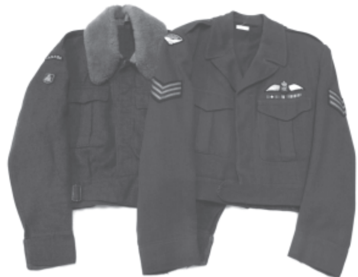
Fig. 2 Second World War RCAF working dress jackets: Left, a private's coarse fur-lined serge jacket with aero-engine mechanic's badge (catalogue #2001.0215.1) buttons to the neck. Right: A Sergeant's jacket made of better quality material (catalogue #1975.0660.1) has mounted ribbons and open collar for a neck tie.