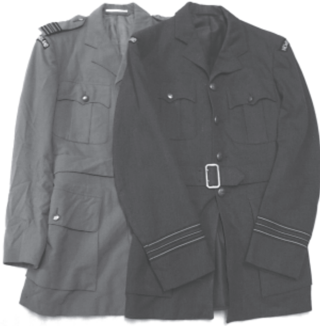
Fig. 9 The British Commonwealth Air Training Plan agreement allowed participants and graduates to wear nationality shoulder insignia. These Second World War RAF uniforms (left: catalogue #1994.0556.1 & right: 1994.0557.1) have Newfoundland shoulder insignia. Newfoundland was a British colony until 1949.