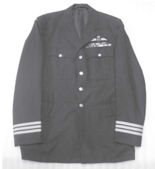
Fig. 15 Despite the pre-unification RCAF pilot's badge, this rifle green Canadian Forces service dress uniform jacket (catalogue #1993.0408.1) could not have been worn before 1968. A small act of resistance against unification by this Second World War veteran?

Less British and more Canadian: As noted above, armed forces are often seen as an outward expression of national will and character. Canadian Forces unification was introduced the year after Canada's Centennial in 1967. The late 1960s was a time when Canada was increasingly confident and seeking to redefine itself and assert a unique identity that was neither British nor American. It also coincided with a period in which the Canadian government was reducing its international commitments to focus on domestic policy and developing new social programs. In adopting a more distinctly Canadian military uniform, the Canadian government was perhaps hoping to reflect the new realities of a