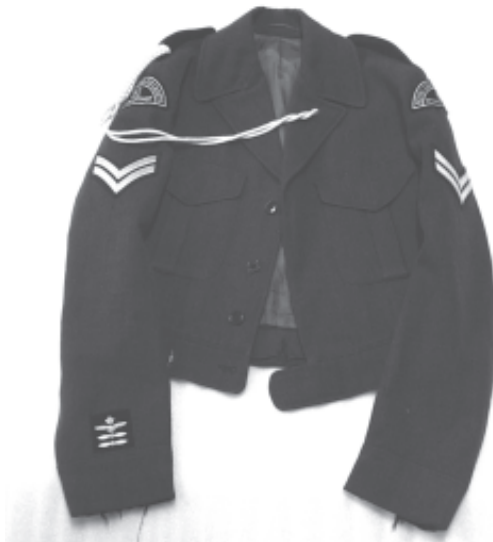
Fig. 10 A Royal Canadian Air Cadet corporal's jacket from No. 51 Ottawa Optimist squadron (catalogue #1994.0553.1). Compare the style to the RCAF working dress uniforms (Fig. 2). Note the proficiency badges on the right sleeve.

qualification badges, so in 1943 official Canadian air crew issues began to appear. These included an embroidered “RCAF” in line on the Pilot’s badge (see Fig. 14). The same monogram appeared in smaller letters on all other flying badges (Fig. 7). 57