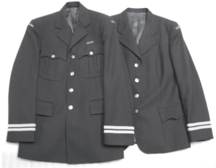
Fig. 16 In 1985 the Canadian Forces (Air Force) returned to a traditional sky blue uniform. Shown are a man (left; catalogue #1994.0531.1) and woman (right; 1994.0532.1) junior officer’s heavy weight (winter) service dress uniform jacket.

Less British and more American: Given that the new Canadian forces uniforms followed the army model, it is striking how they contrasted with their predecessors, which had resembled the brown and khaki uniforms worn in the British Army. Many observers felt that they looked “American” since dark green is the colour traditionally preferred by the U.S. Army. Since the Second World War, the RCAF had placed less emphasis on the need for Imperial cohesiveness (which had dominated its