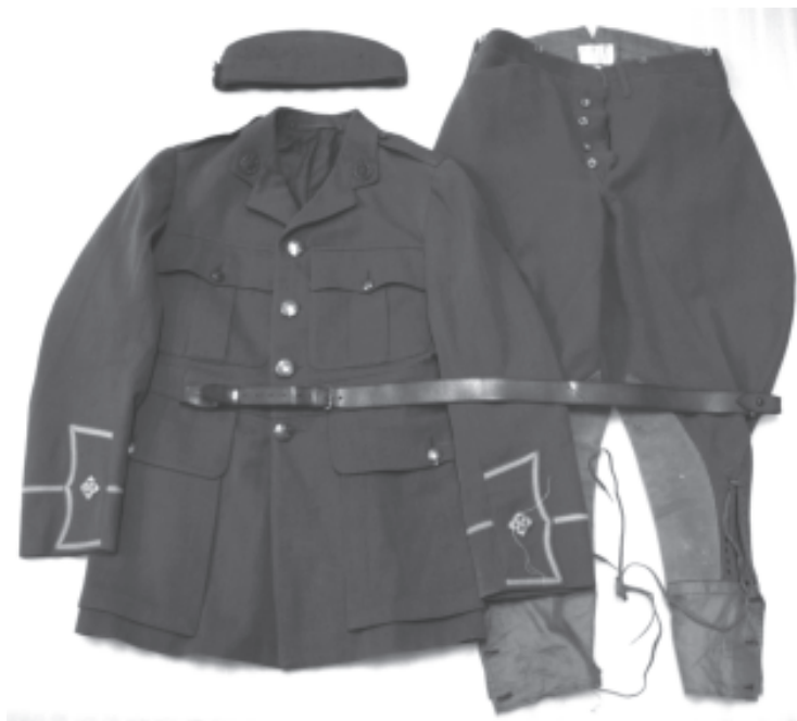
Fig. 3 This Royal Flying Corps pilot's khaki service dress uniform is remarkably complete given its age. Shown here are the service dress jacket (catalogue #1977.0048.3), riding breeches (1977.0048.1), field service cap (1977.0048.4) and a shoulder strap from a Sam Browne belt (1977.0048.5).

The RFC was initially composed of personnel from the Royal Engineers, airship ratings (enlisted personnel) from the Royal Navy, and army personnel seconded from army regiments, who all wore the uniforms of their parent service with RFC badges and insignia added. Since the RFC Army Wing was part of the British Army, it adopted the British Army dress orders, including the standard khaki undress uniform and peaked general service cap, with distinctive brass RFC badges and buttons. Pilot and observer wings were worn over the left breast pocket of all uniform jackets. The standard