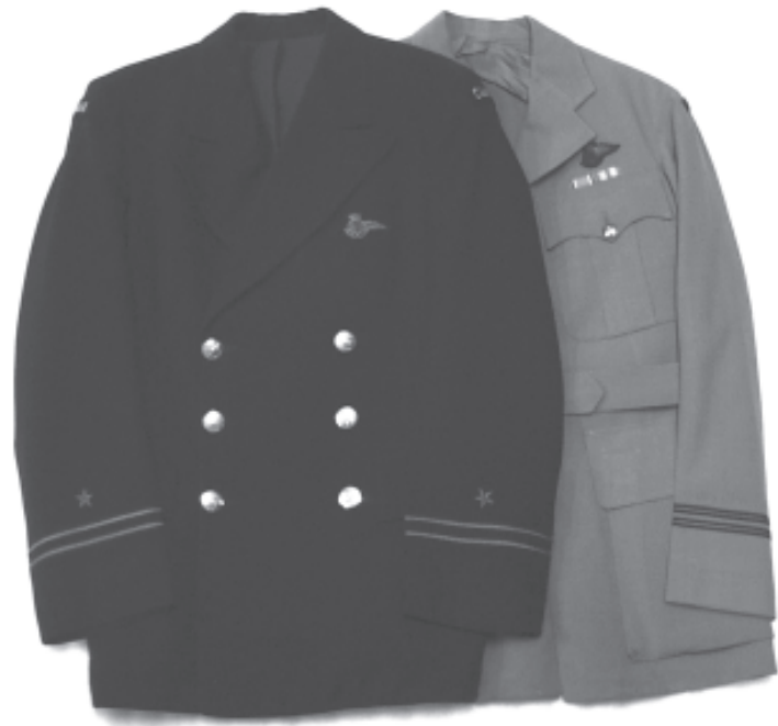
Fig. 11 The Ferry Command blue blazer at left (catalogue #1991.0700.1) from the early years of the Second World War resembles that of a civilian airline employee. On the right is an RAF summer service dress jacket (1991.0701.1). Both feature an RAF No. 45 Transport Group radio operator's badge.

Following the creation of the Royal Canadian Navy in 1910, many Canadian naval pilots served in Britain's Royal Navy and RNAS. 63 When the RCAF was formed in 1924, it provided flight training to Canadian naval personnel. Early in the Second World War, the Royal Canadian Navy (RCN) sought to recreate a version of the RCNAS from the First World War (see above) to conduct anti-submarine warfare and protect convoys crossing the Atlantic. The RCAF opposed the suggestion, since the shore-based aircraft of its Maritime Command patrol squadrons were already providing air cover for the fleet in cooperation with the navy. Senior naval planners argued that it was more effective for airplanes to operate from escort carriers that could accompany the convoy or fleet, and that single control by one service was more efficient than inter-service coordination. The Canadian government decided to maintain the status quo for the duration of the war due to fears that maintaining two air forces would lead to duplication of command and support services, and would be a drain on resources.