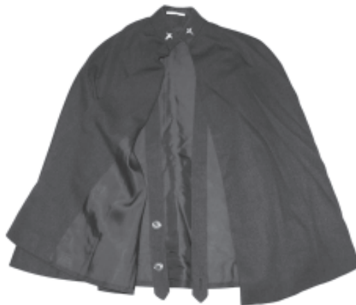
Fig. 8 This Second World War RCAF nursing sister’s cape (catalogue #2001.0418.1), optional wear with the formal dress(es) white and mess dress uniforms, is dark blue with a bright cherry lining. Note the medical collar badges.