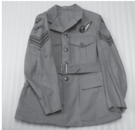
Fig. 7 This unlined Second World War RCAF Sergeant’s summer service dress uniform jacket made of canvas-like material (catalogue #1998.0856.1) is similar to the Canadian Army khaki drill jacket. Note the 1943 pattern Navigator’s badge, red wireless operator badge and pattern 2 shoulder eagle.

At the beginning of the Second World War, temporary modified RAF badges were issued to Canadian flyers. These were almost identical to the RAF pattern except that an embroidered “C” was superimposed over the “RAF” in the central circular field of the Pilot’s badge (see the uniform at right in Fig. 2). RCAF personnel demanded distinctive