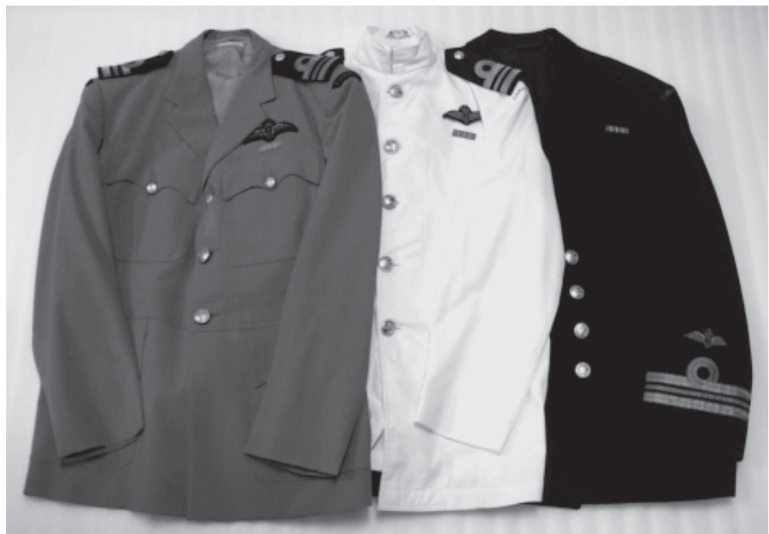
Fig. 12 Royal Canadian Navy pilot's uniform jackets. Left to right: khaki summer service dress with looped naval rank braid on the shoulder boards (catalogue #1992.2223.1); navy white dress with a stand-up collar (1992.2225.1) and navy blue dress blazer with a pilot's badge on the sleeve (1992.2224.1).

As seen above, the Royal Canadian Navy followed the example of its British and American counterparts in forming its own air arm in 1946, effectively creating a specialized air force within the naval service. By contrast, Canadian Army aviation has remained relatively modest in scale. 69 The Canadian approach has been inter-service cooperation, with RCAF crews assigned to facilitate troop deployment