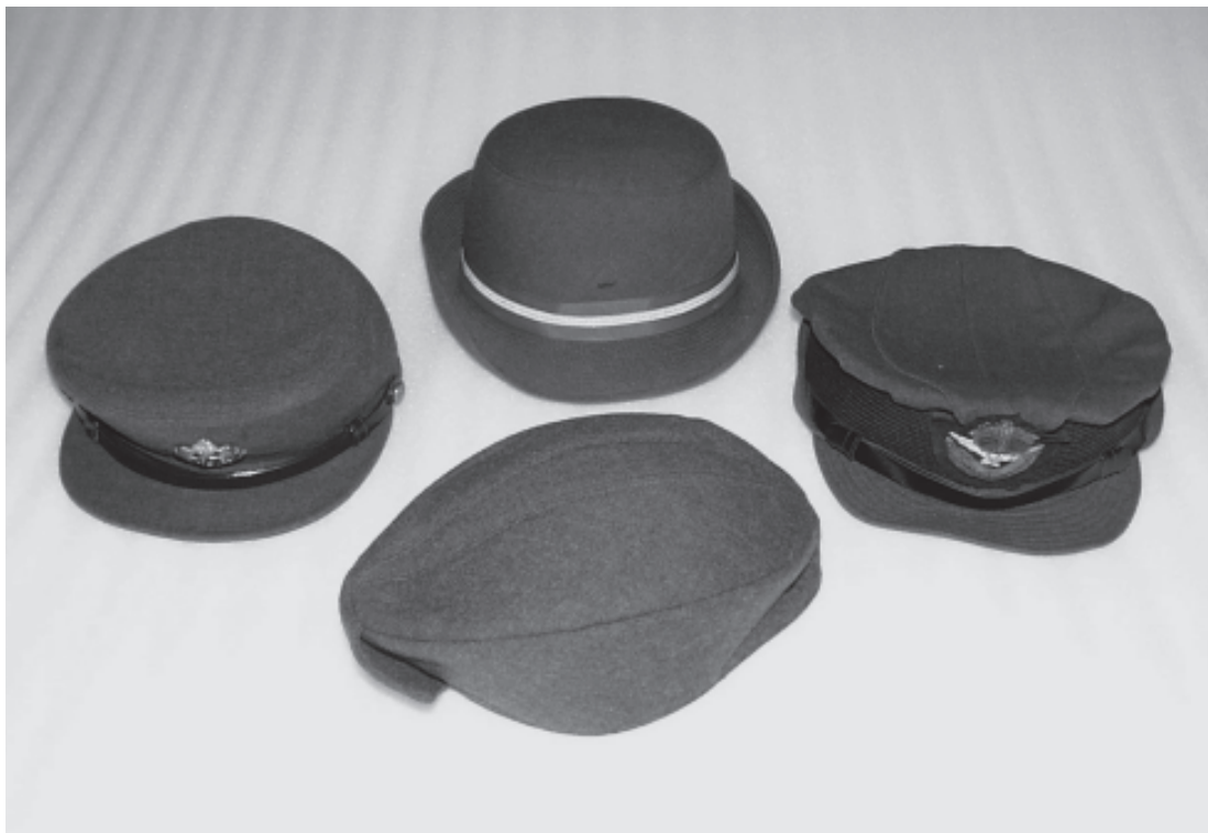
Fig. 17 Examples of female RCAF head dress. Left: “kepi” service cap (catalogue #1966.0897.1). Above: “bowler” military police service cap (catalogue #1994.0184.1). Right: “pinched” crown service cap (catalogue #1999.0317.2). Below: “stewardess” wedge field service cap (1966.0194.3).