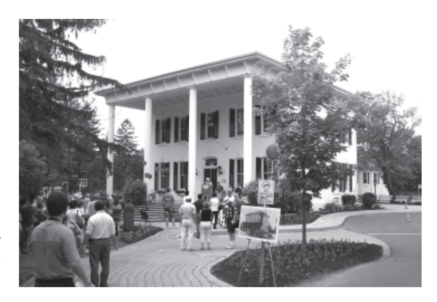
Fig. 1 In 2005, residents of Meadowvale Village celebrated the 25th anniversary of their community becoming Ontario's first heritage conservation district. The Gooderham Mansion (c. 1860), associated with the famous Toronto distillers, was restored by Monarch Development Corporation served as a sales office for a nearby subdivision of new homes designed to be architecturally complementary and is now a private school.

After 1982, however, heritage identification and planning slowed considerably. There have been almost no heritage designations without the owner's consent or request. In 1992, the City even repealed designation of one of its own heritage buildings, Mississauga's only example of the Prairie style of architecture. An elderly tenant was evicted to make room for an overflow parking lot. All this took place against the advice of the heritage committee.9 In 1994, the heritage committee was restructured, eliminating the privilege enjoyed by organizations like the Mississauga Heritage Foundation to nominate people whom they regarded as experts or champions of heritage. All members henceforth would be named directly by city council. The committee was put under the chairmanship of a relatively unsympathetic councillor. Meanwhile, the heritage coordinator lost his only assistant, leaving one full-time staff member to deal with matters of historic preservation. This left little time for anything but processing routine applications for alterations of alreadydesignated heritage properties. Only recently, with the creation of a heritage conservation district in Old Port Credit Village, at the strong urging of many of the local residents, have there been signs of a possible renaissance of heritage advocacy and policy in Mississauga.