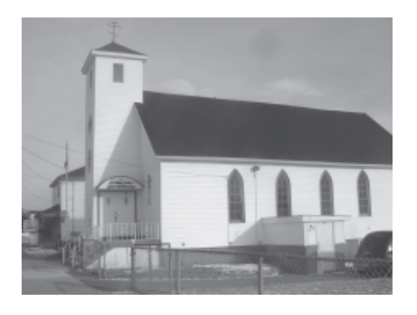
Fig. 8 St. Phillip's African Orthodox Church, completed in 1928, is one of the landmarks in the multicultural, multiracial, working-class Sydney neighbourhood of Whitney Pier. The community sat in the shadow of the now-dismantled steel plant.