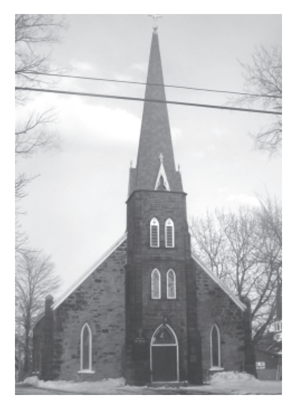
Fig. 3 St. George's (c. 1785) was the fourth Anglican church to be erected in Canada. Home to a famous chair from Admiral Nelson's HMS Victory, it is the most visible structure in Sydney's North End. The area is slated to become Cape Breton's first heritage conservation district.

The Cape Breton Regional Municipality appears also to have been sluggish. Only three properties have been designated since amalgamation. Two took place at the request of the owner, and the third was the designation of the municipally owned Glace Bay Town Hall, but only after the applicant, the Glace Bay Heritage Museum Society, promised to restore it within a year so that it would not be a burden on the municipality.<sup>10</sup> The municipality's Heritage Policy defines the "applicant" for designation as "the owner"—and the said party must pay $285 to obtain a designation, although the encumbrance of a designation could well be characterized as a contribution to the community. Until 2005, the heritage committee seldom met. The minutes of a 1998 meeting report that municipal staff advised members that, "There is no set criteria on the number of times the Committee has to meet; it will depend on the number of applications which are received."11 Few property owners have been insisting on designations and thus the committee has been largely dormant.