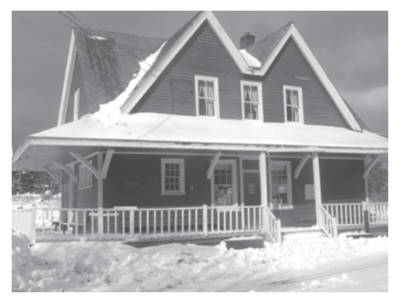
Fig. 9 Until the dramatic decline of the coal and steel industries became apparent in the 1960s. Louisbourg's restored former railway station (c. 1895) was a site of constant activity, where exports and passengers destined for the town's Atlantic harbour were offloaded. The "S and L" Railway is often remembered as a neighbourly operation, having taken families for picnics in the country and making emergency runs for physicians.

though many of the small businesses have closed. But the haze from the steel plant is gone, and the community below is being touted, probably more than ever, as a treasure of cultural geography—and an important attraction. With this new aesthetic and economic orientation, the skills and values of residents who are members of the intellectual and cultural sectors may come to be more prized than ever.