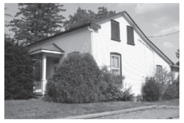
Fig. 5 The Moody-Trachsler House (c. 1830s) is believed to be the oldest remaining residence in Cooksville, a central-Mississauga neighbourhood that, during the past generation, has lost most of its heritage buildings. Municipal staff and the City's Heritage Advisory Committee have recommended designation. The ward councillor has opposed designation, citing property rights and warning residents that if the house remains, a future developer will obtain higher densities on the adjacent lands.

However, such rationalizations may have little to do with the provincial legislative framework and more to do with the municipal officials' lack of concern for preservation. On April 28, 2005, Bill 60 (An Act to Amend the Ontario Heritage Act) received Royal Assent. Municipalities will now have the authority to deny demolition of heritage-designated buildings, subject to appeal to the Ontario Municipal Board. Four weeks after Royal Assent, the city solicitor provided the Mississauga council with a report summarizing the new legislation. The mayor and councillors were not