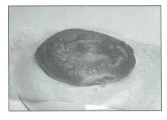
Fig. 3 Open Window Health Bread Bakery blueberry bun cut open