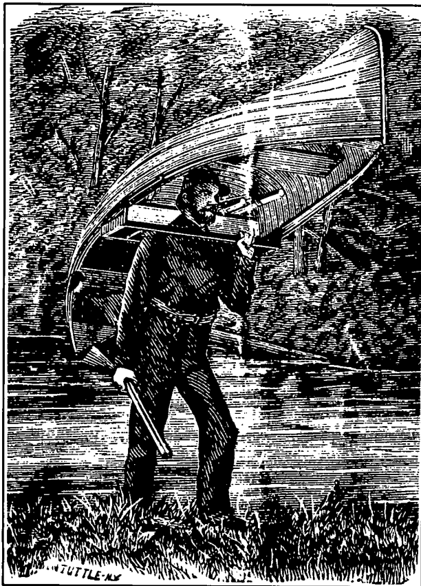
Fig. 3 "This is the way Adirondack sportsmen and guides carry their boats." This illustration is from the cover of Rushton's 1888 catalogue. It illustrates a pulling boat, not a canoe, but the yokes were similar.

The Adirondack Museum collection contains six boats of the type Rushton would have called "hunting canoes." Hunting canoes were aimed at sportsmen — people who were using the boats as transportation in hunting or fishing. The finish was usually paint, varnished