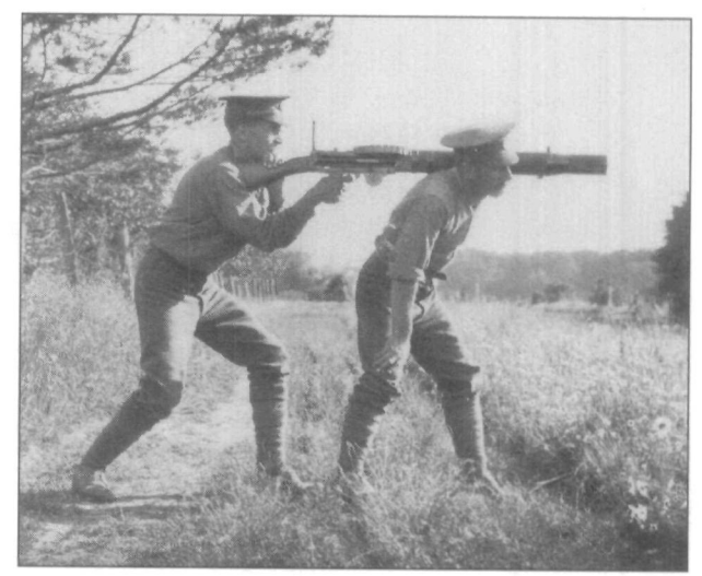
Fig. 3 Lewis light machine gun. Though there is no record of it having been used in the manner demonstrated, this photo shows its comparative lightness and ease of use.

Like any other technology, the Lewis was only as useful as its users were skillful, and