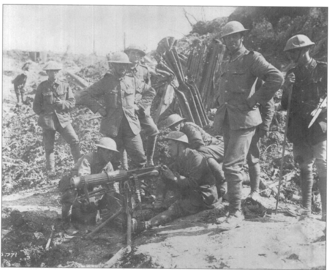
Fig. 2 Vickers machine gun. More reliable than the Colt, this photo clearly shows that it was not much more mobile, and had to be broken down into pieces to get it across no-man's-land.

while the number 1 locked it into place. The number 3 carried 250 rounds of ammunition, handing it to the number 2 when needed, and the number 2 loaded it into the gun from one side while the number 1 pulled it through and ensured it was feeding properly, cocking the weapon at the same time. It was then ready for firing. <sup>16</sup> Three other members of the six-man team were responsible for carrying extra ammunition, the Vickers being able to fire 600 rounds a minute.