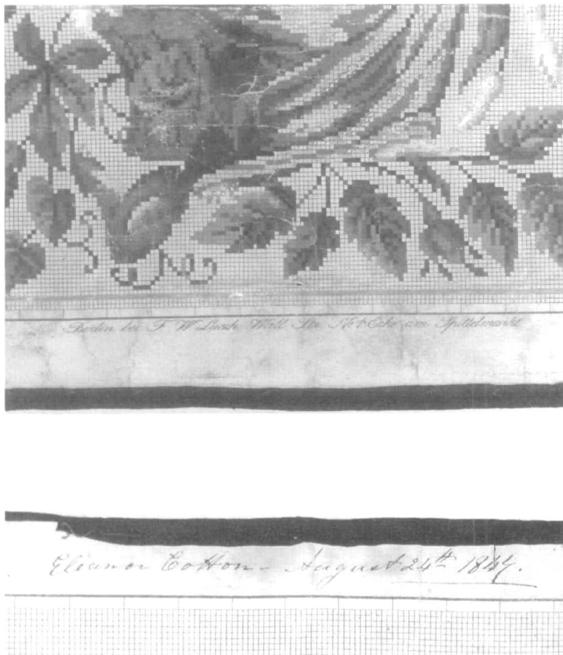
Fig. 3b Detail.