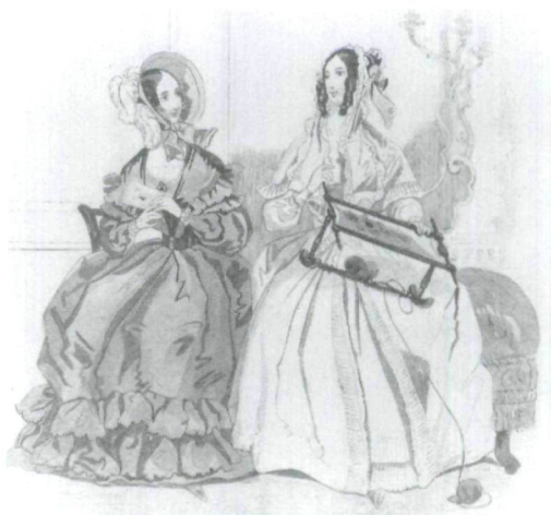
Fig. 4 Godey's Lady's Book, February 1840.

In the middle of the nineteenth century, although European mail and newspapers arrived in Montreal regularly (in winter via Boston or Portland, Maine), merchants had to wait for the opening of navigation in April to replenish their stocks. The newspapers of the time reflect in both editorial and advertising content the feeling of excitement at the renewal of mercantile activity after an enforced hibernation.