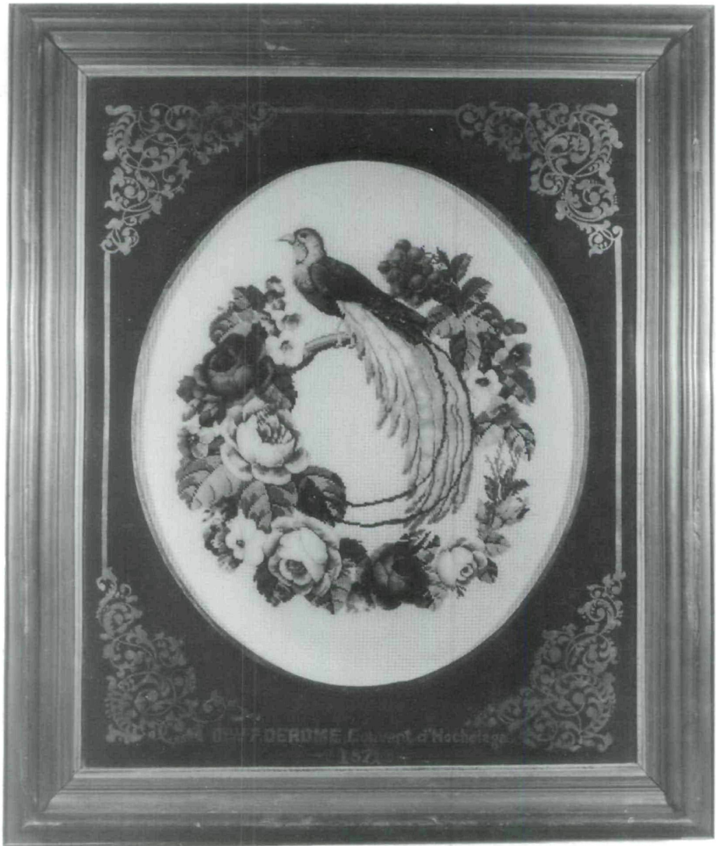
Fig. 1 "Philomène's Peacock." Wool on canvas, 1871, 89.5 cm x 74 cm. (McCord Museum of Canadian History, M992.44.1)

needlewoman, the convent at which she studied and the year in which the work was completed (Fig. 1). Even a brief study of this work encouraged further investigation of both its provenance and the tradition of Berlin work, particularly in Canada. Much has been published about ecclesiastical embroidery of the eighteenth and nineteenth centuries, 2 but