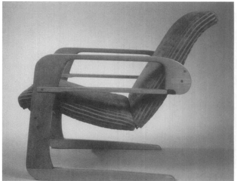
Fig. 1 Airline armchair by Kem Weber, ca 1934–1935.

The Postwar Modernism gallery is the largest space in the show. Three captions introduce the work, detail the use of contrasting lines and explain technological changes that made possible the new directions illustrated by the artifacts. The highlights of the first furniture grouping here are the "Hanging Light Fixtures" by Massimo Vignelli. Made of multicoloured glass and almost two feet long, the lamps greatly