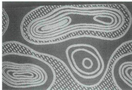
Fig. 2 Surrey drapery textile by Marianne Straub, 1951.

Design work by several fine artists is included in this gallery. Salvador Dalí gives us six semi-abstract tiles, the eerie "Leaf Hands" fabric and the "Persistence of Memory" brooch. Fernand Léger and Alexander Calder both contribute fabrics to this gallery and the two works of Picasso shown here are his "Plate" with the dove motif and the extremely large, clown-like "Vase." On the whole, this gallery balances very successfully the earlier galleries that illustrated the original negative attitudes