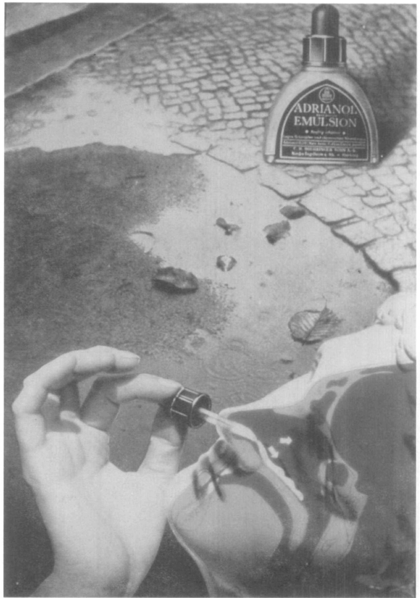
Fig. 4 Adrianol poster by Herbert Bayer, 1935.

as an aesthetic whose time has passed and introduces the Stewart Collection, as well as the exhibition itself. Here and in his introduction to The Modernist Canon , he discusses the choice of 1935–65 as the time frame for the show. In the process of justifying that choice, he, of necessity, raises some embarrassing questions about the existence of Modernism, though perhaps different forms of it, in the 1920s and early 1930s – years that are excluded from this exhibition. Generally, his essays for each of the thematic sections discuss the intellectual underpinnings and technologies that created the artifacts in the show. Comments on industrial