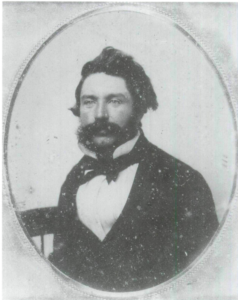
Fig. 1 John Sebastian Helmcken, ca 1860, approximately the period in which most of the artifacts in the Helmcken collection were acquired.

The John Sebastian Helmcken Medical Collection, over 130 accessions, was catalogued in 1988, and a portion of it has been on display since then. During the summer of 1992, a research project was undertaken on the collection as a whole, primarily in aid of the inter-