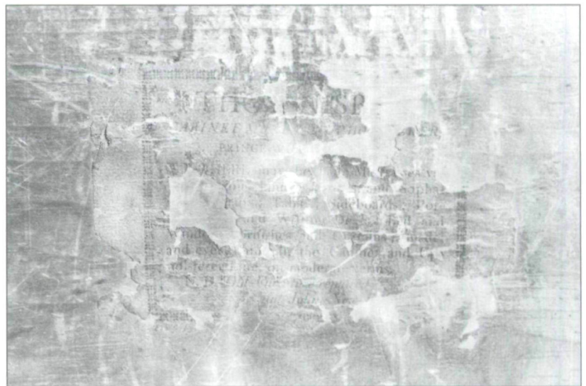
Fig. 2 Thomas Nisbet's earliest label (ca 1815) showing the different border design from all other Nisbet labels known to date.