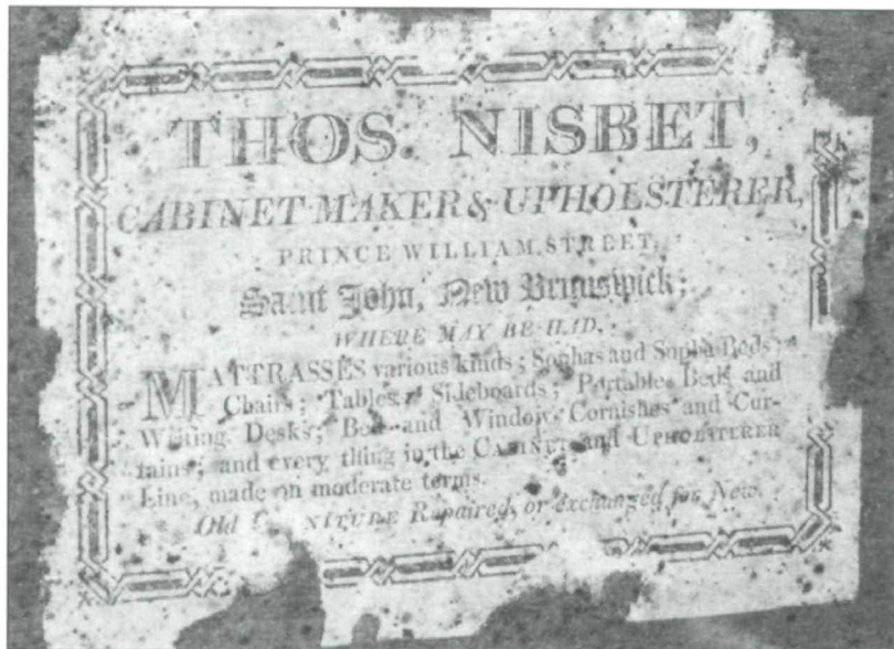
Fig. 4 The second version of Nisbet's second label.

THOS. NISBET, CABINETMAKER & UPHOLSTERER, PRINCE WILLIAM STREET,