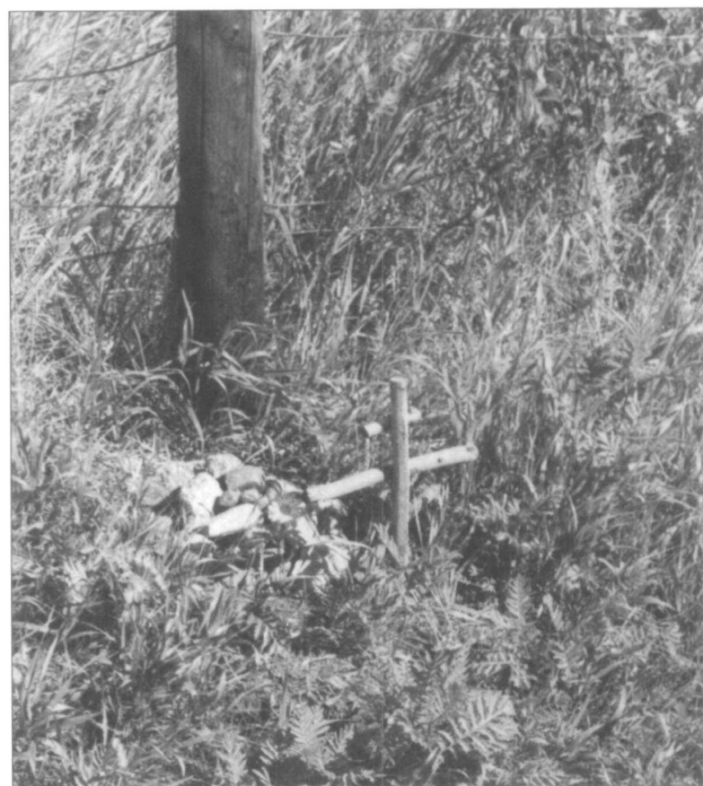
Fig. 5 Simple Orthodox cross marker made from twigs, small stones and an artificial flower at St. Mary's Ukrainian Orthodox cemetery, Szypenitz. The fence post and wires in the background indicate that the grave is on the outskirts of consecrated ground.