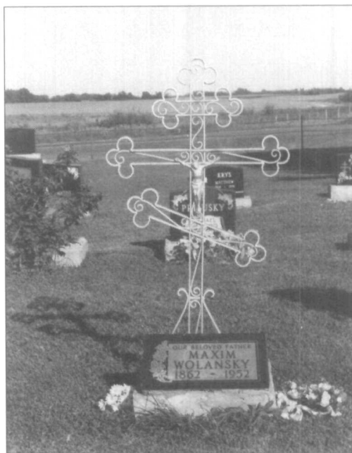
Fig. 4 Metal Orthodox cross marker at Holy Ascension Russian-Orthodox cemetery, Skaro. The statuette of the crucified Christ is of Western spiritual tradition, but the Orthodox cross is clearly of Eastern heritage.

In other instances, individual or group language loss seems to be partially compensated by some ornamental symbol of ethnic identity, such as the neo-traditional geometric "cross-stitch" design. And even modern markers sometimes reflect traditional sex roles, as is clearly the case in the depiction of knitting needles and a ball of yarn on one side of a spousal grave marker, and a convertible automobile on the other. 11