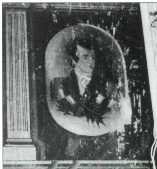
▶ Fig. 3. Robert Burns is portrayed in a corner next to the front entrance.