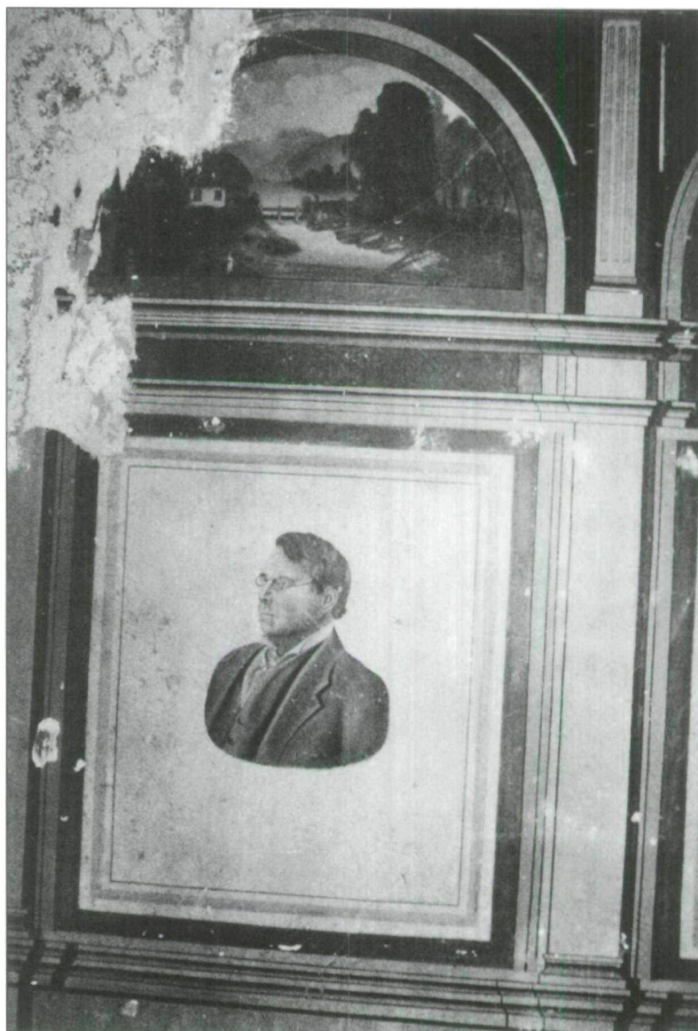
Fig. 1. Sir Oliver Mowat's portrait appears in a panel surrounded by simulated architectural elements.

consort depict the royal pair in middle life, perhaps as they appeared not long before Prince Albert's untimely death in 1861. The visages of Brown, Mowat and Macdonald closely resemble contemporary photographs, reproducing pose and costume as exactly as the painter's skill permitted. George Brown first published The Globe (later the Globe and Mail ) in 1844 and entered the Ontario Provincial Assembly in 1851 as an independent Reform candidate. Later in the nineteenth century he was involved in the "reform" of the Liberal party. Sir Oliver Mowat was a Liberal too, and Premier of Ontario 1872–1892, serving as Lieutenant-Governor of Ontario 1897–1903. Sir John A. Macdonald, a Conservative, was Prime Minister 1867–1883 and 1878–1891. The careers of these personages