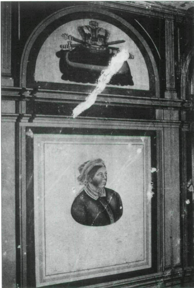
▲ Fig. 2. Queen Victoria's portrait is surmounted by a royal crown resting on a Bible.