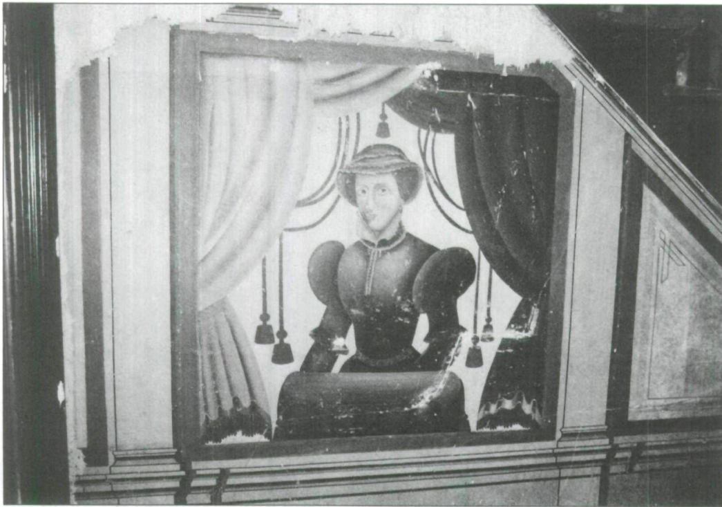
Fig. 4. A Tudor lady, with a pencilled "Anne Boleyn" added by a later hand, appears beside the staircase.

There are three styles or manners of painting here, the relationship between them posing a puzzle. Unlike wall paintings, which open a room by creating an illusion of distance and vista, these firmly structure the interior with illusionary architecture. The technique is that of the limner or artisan decorator, like those of Nova Scotia described by Cora Greenaway. 6 The delineation of these spaces is formal and expert, the work of the trained practitioner who also stencilled the ceiling. The task