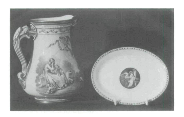
Fig. 2. Mourning china. The pitcher (cat. no. 15211) was made by S. Alcock & Co., Burslem, England, in 1855 to commemorate the Crimean War. The small plate (cat. no. A65.24), possibly meant for calling cards, is also of English manufacture. Made of soft paste porcelain, it has a black enamelled border and a black transfer print picture.