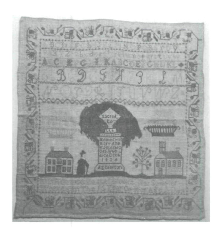
Fig. 5. Cross-stitch mourning sampler (42 cm x 38 cm) made by Ruth Easterbrooke, in 1839 at the age of fifteen years. It is inscribed "Sacred to the memory of Mary Ann Easterbrooke who died Dec. 4, 1836. Aged 6 years." The tombstone and the weeping willow are normal components of a mourning sampler. The Easterbrooke family was probably from Queens County, N.B.

Hair, that most imperishable of all the component parts of our mortal bodies, has always been regarded as a cherished memorial of the absent or lost. A lock of hair from the head of some beloved one is often prized above gold or gems, for it is not a mere purchasable gift, but actually a portion of themselves, present with us when they are absent, surviving while they are mouldering in the silent tomb. Impressed with this idea, it appears to us but natural that of all the various employments devised for the fingers of our fair country-women, the manufacture of ornaments in hair must be one of the most interesting.<sup>3</sup>