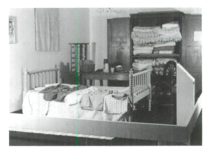
Fig. 1. "L'Amour de Maman" in "Acadians of Louisiana" section.

Several design defects did damage the visual effectiveness of the exhibition. The most disturbing was the crowding of the first section into an area that was too small. The most visually interesting display, which described the custom of "L'Amour de Maman," appeared to be squeezed into a corner (see fig. 1). There was sufficient room in the gallery to move the two large display boxes to more central positions, thus eliminating that problem. The uneven distribution of artifacts, and other exhibit materials, gave the impression that the rest of the display was somewhat barren. The majority of one wall was covered by a row of textiles, while the final wall had a number of photographs displayed as a group. Most of the visual boredom associated with these walls could have