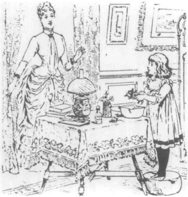
Fig. 10. Detail advertisement for Lundborg perfume, 1888. Mother wears an elaborate and tight fitting gown, while the little girl wears a loose yoked dress. ( Godey's Lady's Book CXVII, no. 700 [October 1888]: ii.)