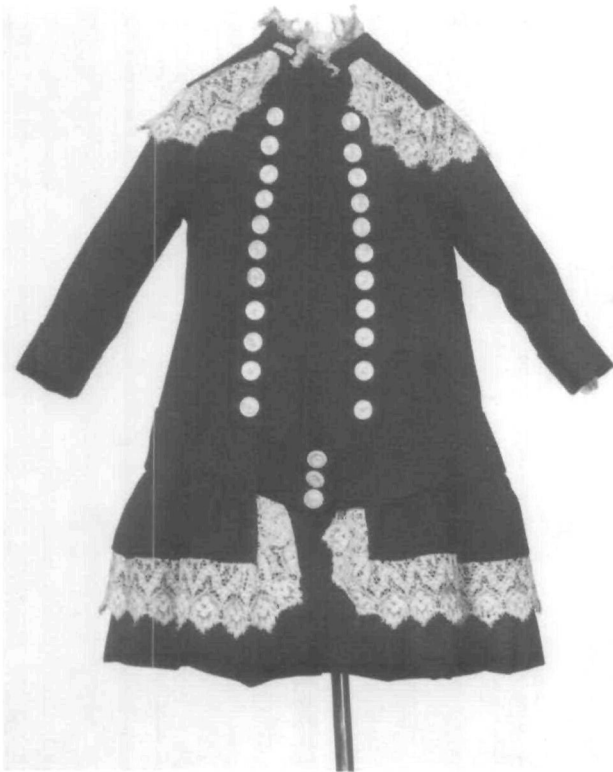
Fig. 9. Child's dress, worn in Guelph, Ontario in 1888, length 52 cm. This bright blue wool twill dress is styled with the plastron and revers of women's fashion but has the distinctly childish loose cut, low belt and sailor collar. (Collection: Royal Ontario Museum, Toronto, Ontario, cat. no. 967.23, a, b. Gift of Mrs. Albert Edward Alison.)

some cases were constructed in a particular way to fit a young figure. While the 1880s woman's bodice was fitted over an hourglass corsetted figure, a girl's bodice was draped loosely over a sash or belt (fig. 9).