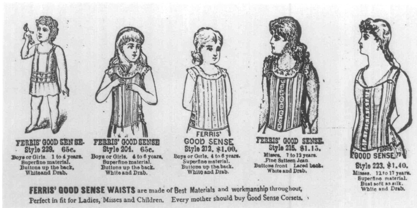
Fig. 2. Eaton's catalogue advertisement for corsets, 1893. By the 1890s corsets or "waists" for children were loose

Another crime of fashion was the vogue for dressing children in low-necked frocks whatever the weather. This