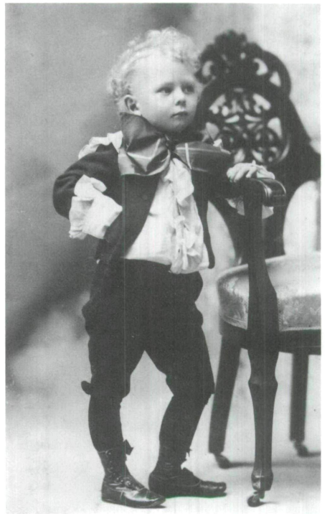
Fig. 7. Boy in Zouave suit, 1890s. This lad is no doubt the show piece of his family. The Zouave style, similar to the faunteroy suit in romance and decoration, was a very popular outfit for photographic portraiture in Ontario.

There was little or no differentiation between boys and girls at these two "petticoat" stages. Indeed, in photographs of children under three years old, it is difficult to tell whether a child is a boy or a girl. Both wore garments indicating their subordination to their parents: the dresses trimmed with lace, velvet and ribbon.