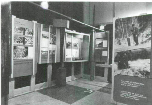
Fig. 1. From section 1, "In the Beginning . . .," a portion depicting lumbering operations in New Brunswick. (Photo: Bob Elliot, New Brunswick Museum neg. no. 00525-9.)

At the outset the curator and the designer were faced with important decisions. The first was whether the exhibit should appeal to the visitor through a spacious and