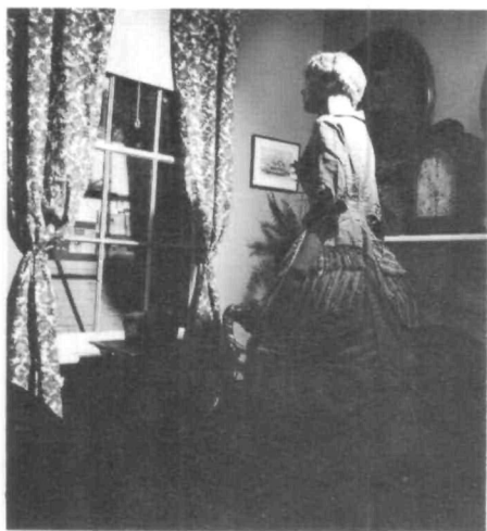
Fig. 4. A room setting in section 3, "The High Degree of Family Involvement in Maritime Enterprise." The setting itself represents that of a late nineteenth-century shipbuilder's parlour.

Marco Polo ; visitors to the gallery should also be told of its fame.