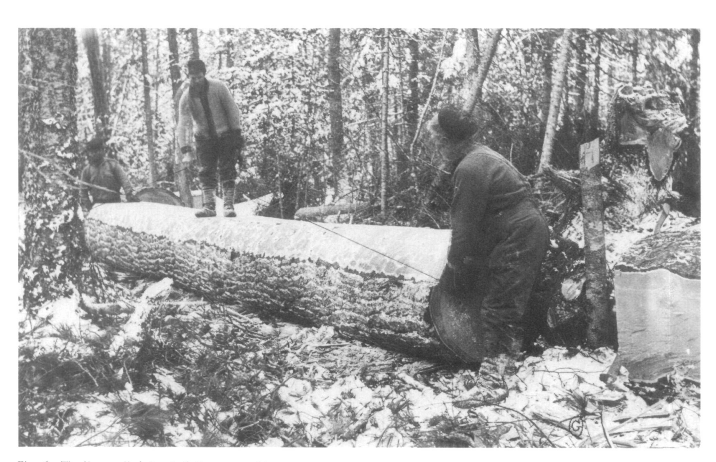
Fig. 6. The liner pulled the chalk line taut and let it snap against the timber, marking a line which was used by scorers and hewers to complete squaring the timber.

In the woods the largest and best trees were chosen for masts and spars, then those that could make a twelve-inch square at the small end were selected and cut down. The process of cutting and squaring timbers in the Kawartha Lakes has been described by Samuel Strickland, from whom the following description is taken. The shantymen were divided into gangs according to their individual skills. One gang cut the trees, letting them fall on a bed of smaller trees, thereby keeping the timber tree from freezing to the ground, ensuring that the axes would not hit stones or dirt, and facilitating the loading process. Once the tree was felled a liner "rossed" (removed the bark a few inches wide along the length of the trunk so that a chalk line could be seen) and lined the tree. The tree was cut to a length determined by the liner, the butt end was squared,