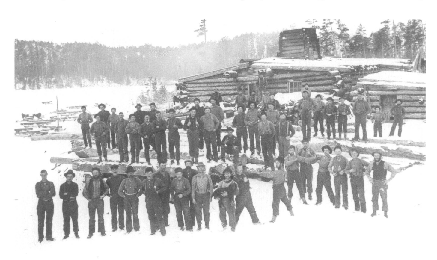
Fig. 2. Booth lumber camp at Aylen Lake, Ontario, ca. 1895. Although taken in the Ottawa River district late in the nineteenth century, this photo illustrates the primitive log shanties built by the larger lumber companies throughout the century. Note the flattened lumber chimney and log construction of both the main shanty in the center of the photograph and the outbuildings. Timber sleighs are to the left.

In November when the ground was hard and there was often some snow, the actual felling of the trees could begin. By this time the supplies would be sent to the camp