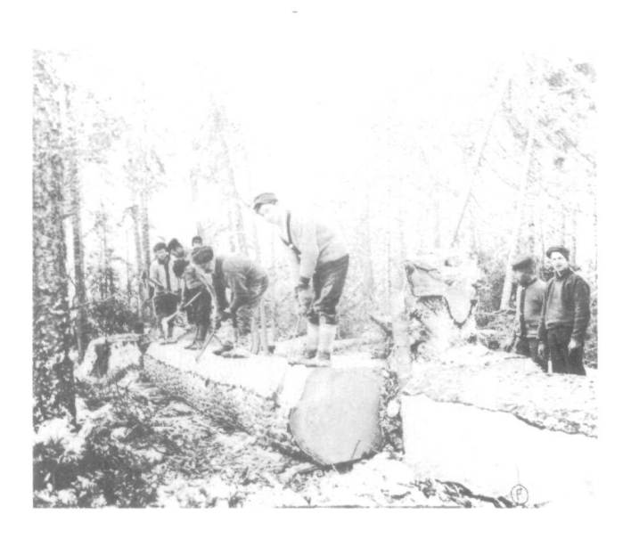
Fig. 5. "Rossing" or removing the bark from a piece of timber in preparation for the chalk line.

was selected for its size and quality and the demands for the British market: "straight, free of rot, disease and well squared." Although the Select Committee on the Lumber Trade reported in 1849 that "little or no skill was required in its manufacture," inexperienced shantymen usually made a substandard product. <sup>25</sup> This latter point is substantiated by Mossom Boyd in 1851 when he was anxious to hire a foreman "who knows elm." He went on to request two or three good hewers and good liners "used to elm" to "make a beginning." <sup>26</sup>