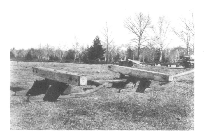
Fig. 8. A one-beam sleigh used for hauling sawlogs, ca. 1880s.

Skidding might be done as soon as the timbers were squared; more often it could be done later, usually after Christmas when there was plenty of snow on the ground to make it easier to haul. Mossom Boyd, at least in the early years, did not start skidding or teaming until after Christmas.<sup>36</sup> For skidding the timber was attached by rope or chain to a "go-devil," a crotch of a hardwood tree. One end of the tree rested on the go-devil which the horse pulled, effectively dragging the timber to the roadway or river. Also used was a "bobsleigh made with a 'heavy traverse bunk of hardwood fixed to support the great weight it had to sustain' and six-inch runners reinforced with steel."37 Sawlogs were first hauled to the road and piled in rollways. For transportation from the roadway to the river timbers and logs could be piled on sleighs and either hauled to the dumps at the edge of the water or actually placed on the ice.3