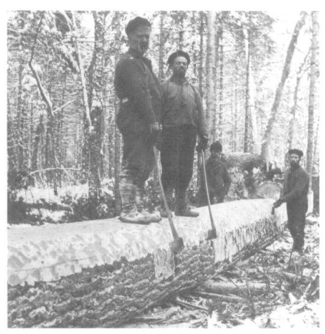
Fig. 7. The scorers moved ahead, notching the timber to the appropriate depth. The hewer followed, using the broad axe to produce a flat surface.

The process for making masts was somewhat different. The bedding was carefully prepared for these tall trees "eighty, ninety, and even one hundred feet being not at all uncommon," as irregularities in the ground "might cause the top to break off too low down, and thus spoil a valuable stick of timber." Once safely on the ground the bark