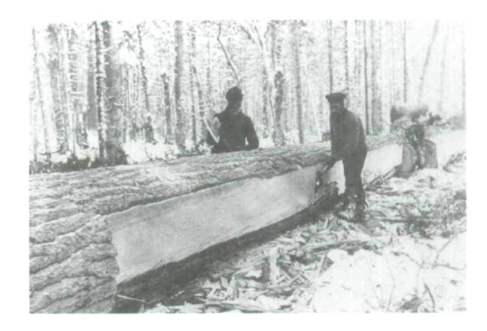
Fig. 4. Hewing square timber.

In the woods the shantyman could look to long days of very physical work at low wages. Work was dangerous with injury and sickness being relatively common among the men. The danger and excitement of the work gave some respite as did the odd bout with alcohol. This, however, was an expensive diversion for the shantyman, resulting in fines as well as loss of pay. While the labour market for lumbermen was already an international one, the poor wages and conditions show that rather than there being competition for labour, in most years there was an excess in supply.