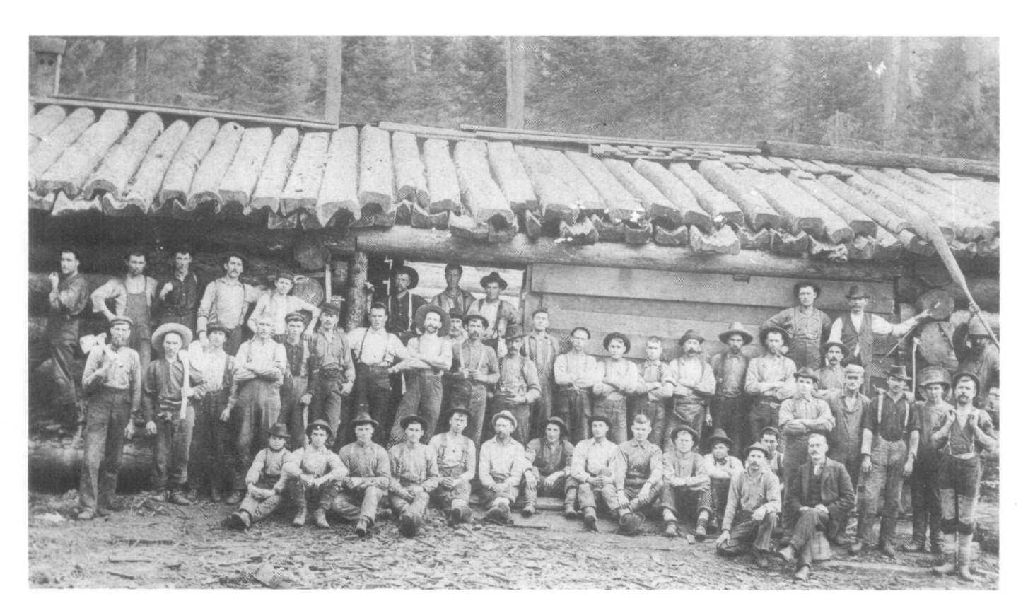
Fig. 3. This lumbering camp, Ontario 1895, illustrates the scoop roof typical of early shanties in Ontario. Note the similarity of dress among the shantymen.

* The differences in the exchange rate between British and Canadian currencies are found in the original sources.