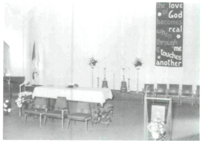
Fig. 3. St. Albert parish church.

Jodo Shin-shu ("True Pure Land School") is a form of Buddhism said to have been founded by Shinran (1173-1262). Orphaned as a child, he set out in search of understanding, peace, and enlightenment following a time-honoured path. He entered the Tendai monastery on Mount Hiei and studied with the great teacher Honen (1133-1212). Honen taught him to place his religious commitment in the recitation of the Buddha's name as found in the formula called the Nembutsu . Through this practice,