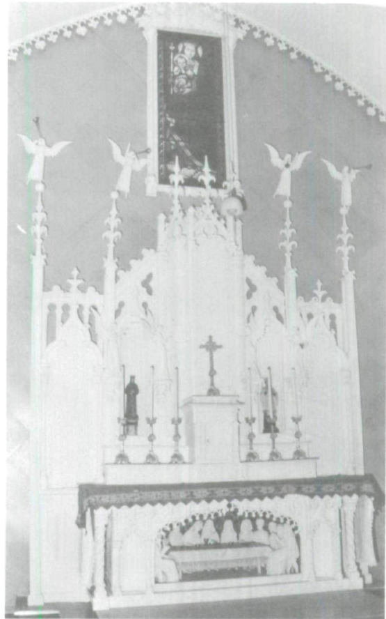
Fig. 1. The Chapel, Bishop Grandin's House, St. Albert.

The current move within the Roman Catholic church is to shift the emphasis from the altar as womb and tomb to its place as the communion table. The altar is the "Table of the Lord," and, in the words of the