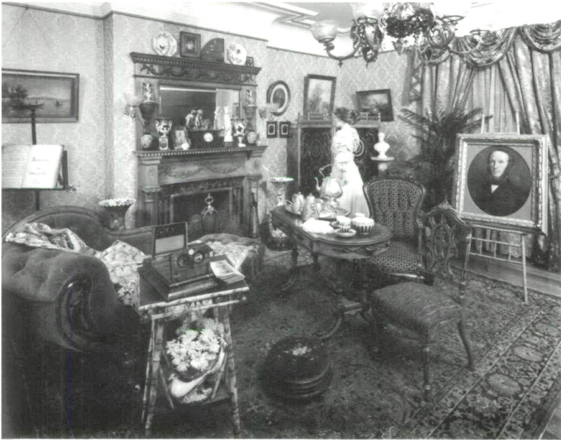
Parlour, ca. 1895, Canadian History Hall, National Museum of Man. (Photograph by National Museums of Canada, neg. no. 77-6273.)

produces a memorable spectacle because of its stark contrast with restrained contemporary interiors. For younger visitors it can induce a fashionable nostalgia; for older visitors the charm is for the familiar (of the "well, Aunt Harriet still has a table just like that" variety, so well known to curators) elevated to history. The parlour here fulfills all such expectations. The stuff of which Notman's photographs are made, it creates a comfortable balance of complacency, order, and vulgar provincial display. One might prefer dinner or even