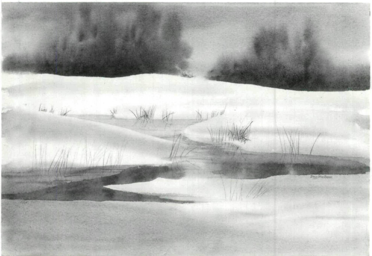
"A Few Acres of Snow", Doug MacBean, watercolour, introduction to Canadian History Hall, National Museum of Man.

Happily this is not just a "folk life" look at everyday life, nor a glorification of past struggles and present success, but a critical and at times illuminating view of the societies