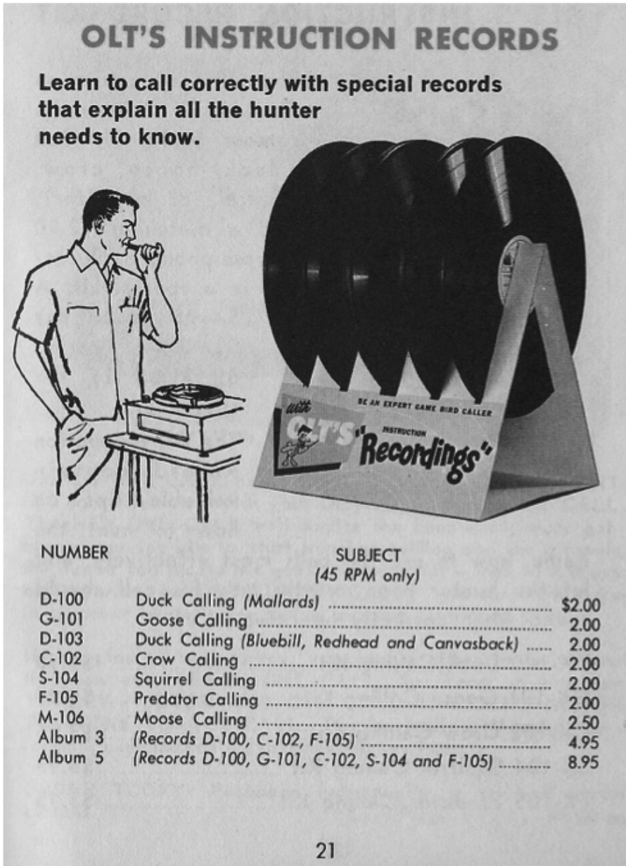
Fig 2a. Olt's Instruction Records and Kit, Olt Hunting Manual. P.S. Olt, c.1950.