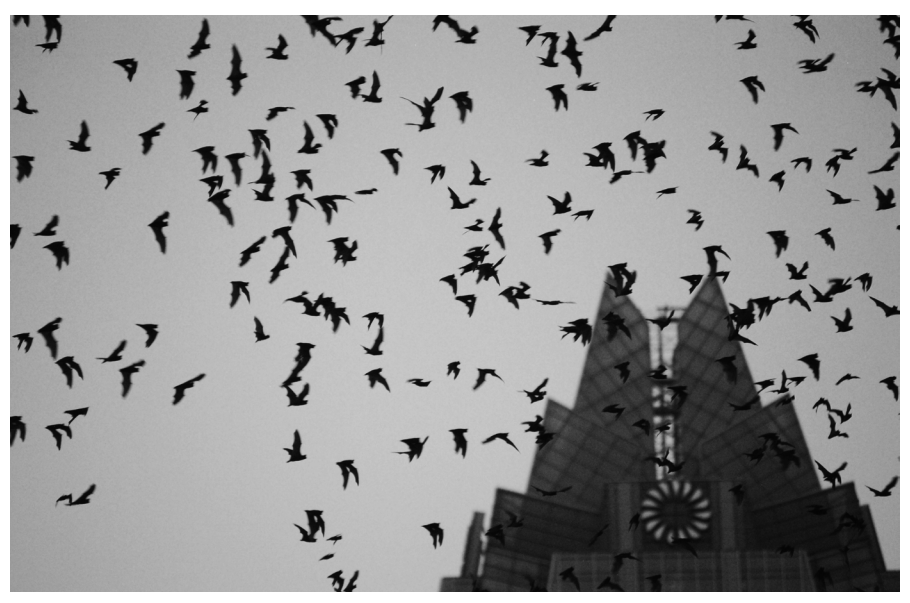
Fig. 2. Mexican Free-tailed Bats flying in front of the iconic Frost Tower in downtown Austin. Photo by author, 2017.