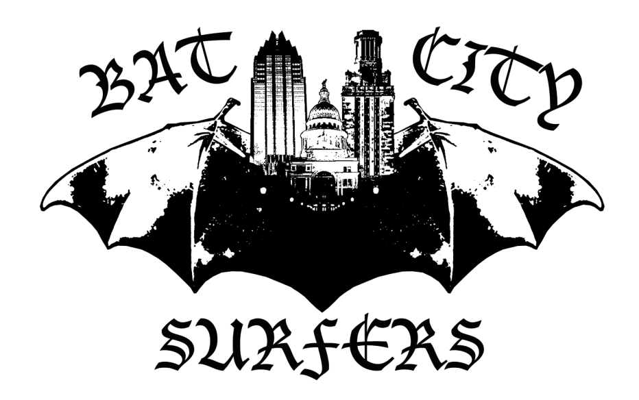
Fig. 4. Bat City Surfers logo.

Blurring the lines between truth and (science) fiction allows the Bat City Surfers to align themselves genetically on a continuum with Chiropteran