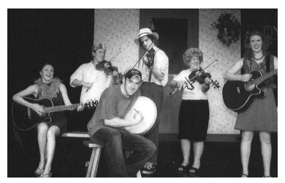
Fig. 4. La Cuisine à Mémé, 2004.

The popularity of La Cuisine à Mémé inspired successive musical theatre and other productions that continue to be staged annually in the région Évangéline and surrounding areas. These productions provide seasonal employment to the area's local artists and thus serve as short-term economic tools for the community. Contrary to MacDonald and Jolliffe's predictions for the development of a thriving cultural tourism industry in the region (2003), however, as a result of the 2005 closing of Le Village de l'Acadie, a pioneer museum constructed in the 1960s, due to bankruptcy, rural cultural tourism in the région Évangéline has fallen short of producing any long-term economic benefits. Although there are some other small attractions in the region, such as the impressive Maison de bouteilles (a series of buildings made entirely of glass