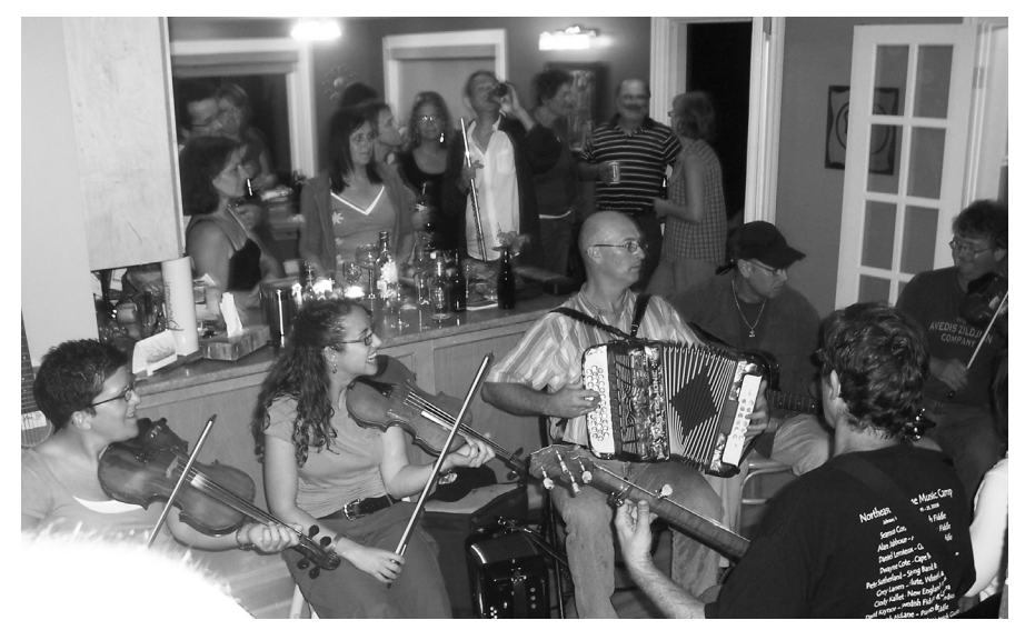
Fig. 1. Kitchen party, July 2008.

This article examines how tradition, tourism and identity discourses intersect in representations of "Acadia" at play on PEI. Focusing on the phenomena of Acadian kitchen parties and dinner theatre productions, I consider how the Island Acadian community represents itself and is represented musically in and beyond the Island's cultural scene. I explore how tourism shapes PEI's cultural landscape and how movement to (by tourists) and from (by touring local musicians) the Island informs how francophone Acadian identity is understood and expressed musically. More broadly, I question how, by commodifying tradition, tourism contributes to defining and marketing the