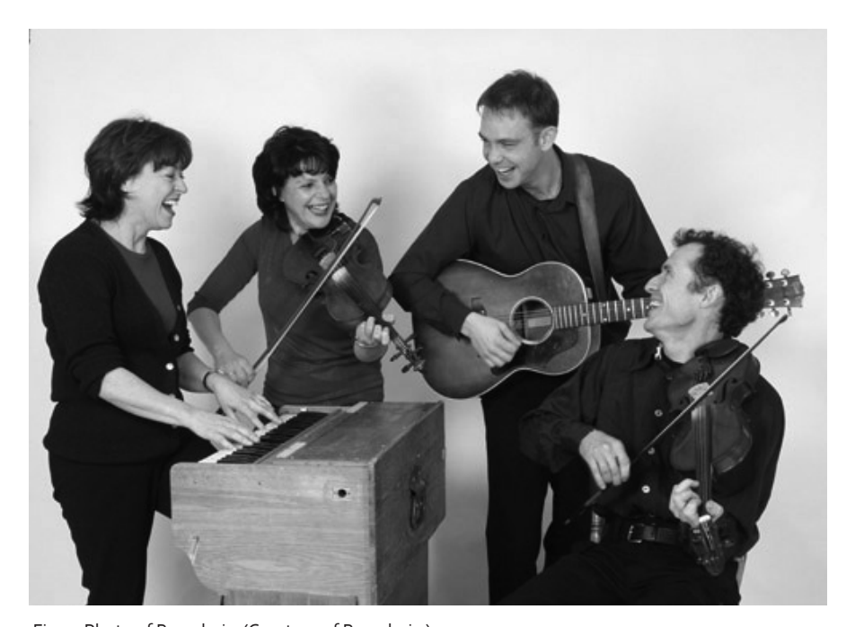
Fig. 5. Photo of Barachois.

performances took elements from the kitchen parties they remembered as typical of the events from their childhood—including stories and jokes; step dancing; comedic routines; and high-energy, foot-tapping music featuring the pump organ, fiddle, podorhythmie (seated foot-tapping), djigger (mouth music), 12 homemade percussion instruments such as utensils and suitcases, and audience participation—and translated these elements to the concert stage (see discography). As group member Helen Bergeron explains, "most of the gags that you see [on stage] are just a recreation of what you used to see at a house party, so it's really easy to get inspired for what to do"(2008). Building on Erving Goffman's structural division of tourist settings into "front" and "back" regions (1959), Dean MacCannell suggests that the frontback dichotomy be treated as "ideal poles of a continuum ... linked by a series of front regions decorated to appear as back regions, and back regions set up to accommodate outsiders" (1973b: 602). Barachois' performances complicate MacCannell's notion of intermediary types of social space, most of which involve some aspect of simulating the "backstage" setting ("stage sets," eat-in restaurant kitchens and so on), in that Barachois unapologetically brought "kitchen music" to concert halls without the pretence of disguising the physical setting as anything but a concert stage. The "authenticity" for which