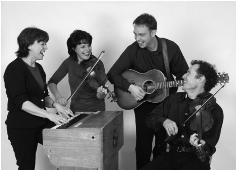
Fig. 5. Photo of Barachois.

performances took elements from the kitchen parties they remembered as typical of the events from their childhood—including stories and jokes; step dancing; comedic routines; and high-energy, foot-tapping music featuring the pump organ, fiddle, podorhythmie (seated foot-tapping), djigger (mouth music), 12 homemade percussion instruments such as utensils and suitcases, and audience participation—and translated these elements to the concert stage (see discography). As group member Helen Bergeron explains, “most of the gags that you see [on stage] are just a recreation of what you used to see at a house party, so it’s really easy to get inspired for what to do”(2008). Building on Erving Goffman’s structural division of tourist settings into “front” and “back” regions (1959), Dean MacCannell suggests that the front-back dichotomy be treated as “ideal poles of a continuum ... linked by a series of front regions decorated to appear as back regions, and back regions set up to accommodate outsiders” (1973b: 602). Barachois’ performances complicate MacCannell’s notion of intermediary types of social space, most of which involve some aspect of simulating the “backstage” setting (“stage sets,” eat-in restaurant kitchens and so on), in that Barachois unapologetically brought “kitchen music” to concert halls without the pretence of disguising the physical setting as anything but a concert stage. The “authenticity” for which