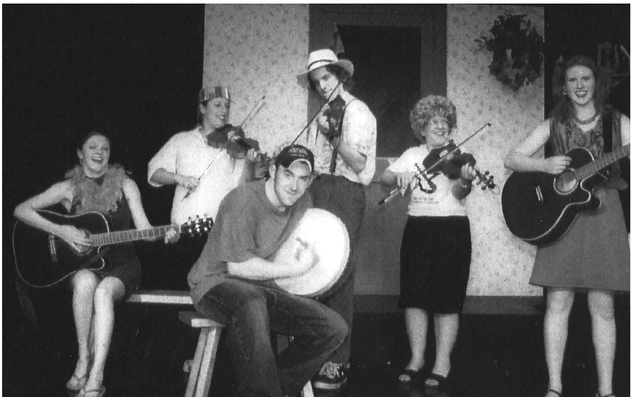
Fig. 4. La Cuisine à Mémé , 2004.

The popularity of La Cuisine à Mémé inspired successive musical theatre and other productions that continue to be staged annually in the région Évangéline and surrounding areas. These productions provide seasonal employment to the area’s local artists and thus serve as short-term economic tools for the community. Contrary to MacDonald and Jolliffe’s predictions for the development of a thriving cultural tourism industry in the region (2003), however, as a result of the 2005 closing of Le Village de l’Acadie , a pioneer museum constructed in the 1960s, due to bankruptcy, rural cultural tourism in the région Évangéline has fallen short of producing any long-term economic benefits. Although there are some other small attractions in the region, such as the impressive Maison de bouteilles (a series of buildings made entirely of glass