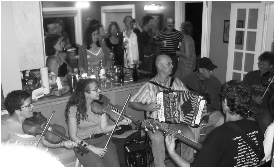
Fig. 1. Kitchen party, July 2008.

This article examines how tradition, tourism and identity discourses intersect in representations of “Acadia” at play on PEI. Focusing on the phenomena of Acadian kitchen parties and dinner theatre productions, I consider how the Island Acadian community represents itself and is represented musically in and beyond the Island’s cultural scene. I explore how tourism shapes PEI’s cultural landscape and how movement to (by tourists) and from (by touring local musicians) the Island informs how francophone Acadian identity is understood and expressed musically. More broadly, I question how, by commodifying tradition, tourism contributes to defining and marketing the