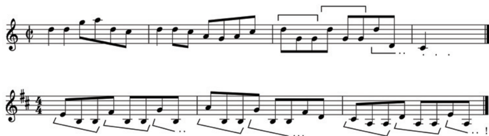
Figure 3. “American” 3 against 4 gesture in “Lost in the Loop” and “Sevens” by Liz Carroll. Top stave: “Lost in the Loop” (3rd part of the tune). Bottom stave: “Sevens” (2nd part of the tune). (Author’s transcription.)

By the third round, this introduction of material outside of the melody begins a little earlier. The first eight measures of the A part are interrupted midway for interpolation 2, which is only four measures long and features lots of tied notes that suggest a jazzy syncopation. This section also hints at what