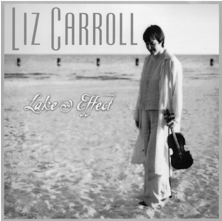
Figure 6. CD Cover of Lake Effect

“Lake Effect,” then, demonstrates the possibility of moving between playing Irish traditional music as emigrant/immigrant music—as opposed to Irish music—and playing it as the music of the ethnic self in situ, or indeed as a music contributing to a broader signification of post-ethnicity. The