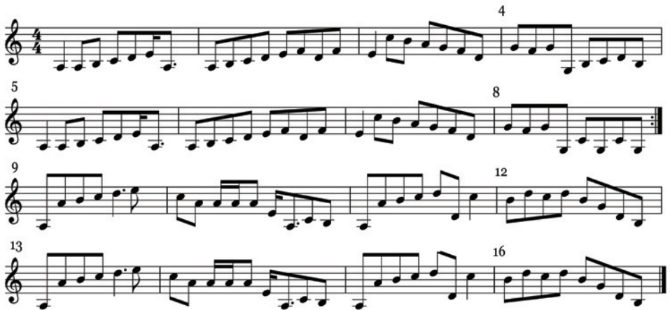
Figure 2. One generic round of "Lake Effect." A part measures 1-8; B part measures 9-16 = two repeated parts give a thirty-two measure round. (Author's transcription.)

The third round sees a combination of both techniques, as well as the inclusion of upper harmonics on the violin in the first part. The second part in this round is given a fuller quartet-like treatment, creating a dense texture, which thins out on a third repeat of this second part now accompanied by sporadic upper harmonics on the violin and pizzicato gestures on cello. In the CD liner notes, the track title of "Catherine Kelly's/Lake Effect" is followed in brackets by the tunes' descriptors: "slip jig and tune." The tune "Lake Effect" is not, significantly, given a structural/formal name such as