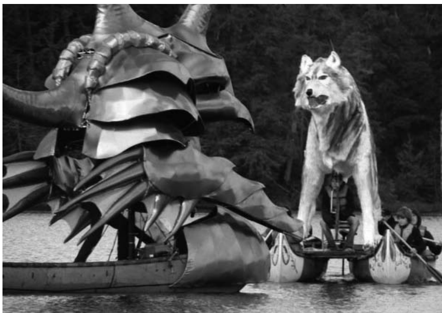
Figure 5a: Performers and vocalists situated in the Three-Horned Enemy canoe and Wolf canoe during rehearsal.