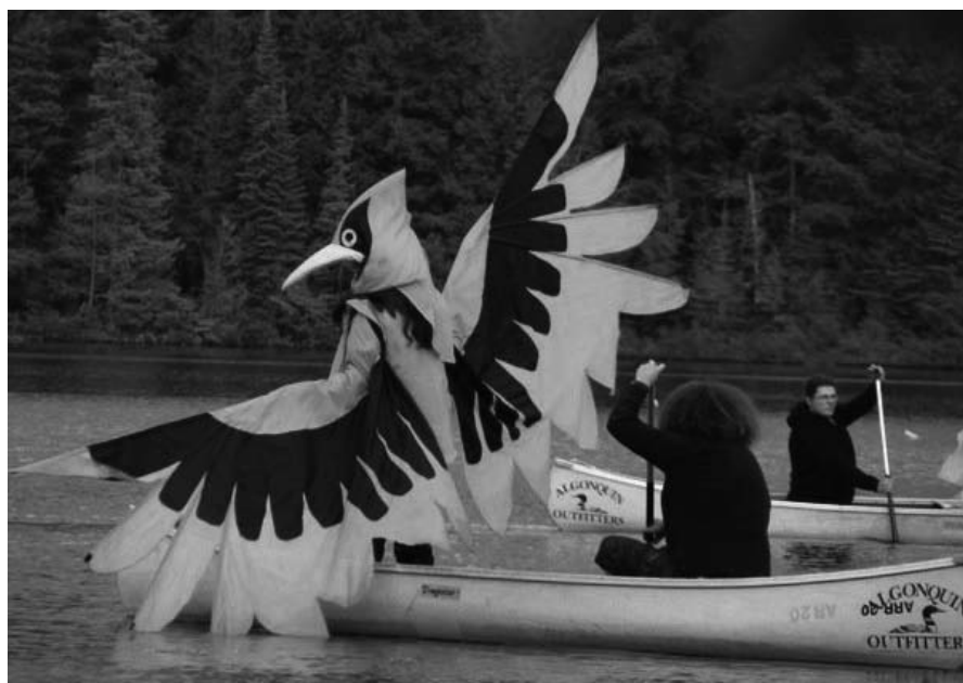
Figure 5b: Dawn Bird canoeists and dancers in rehearsal. (Photos by author, August 2007.)