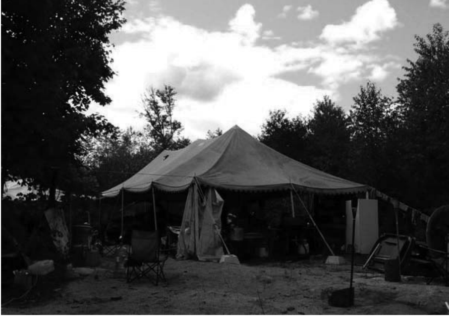
Figure 4a: Bone Lake Production Tent where campfires, meals, informal meetings, and production meetings were held.