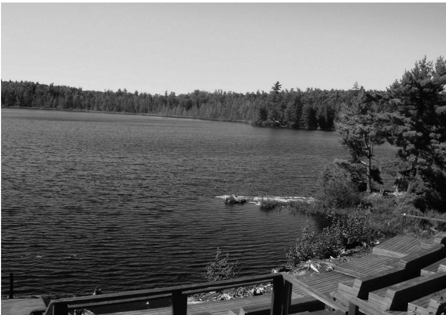
Figure 4b: Bone Lake Amphitheatre, Haliburton Forest and Wildlife Reserve. (Photos by author, August 2007.)