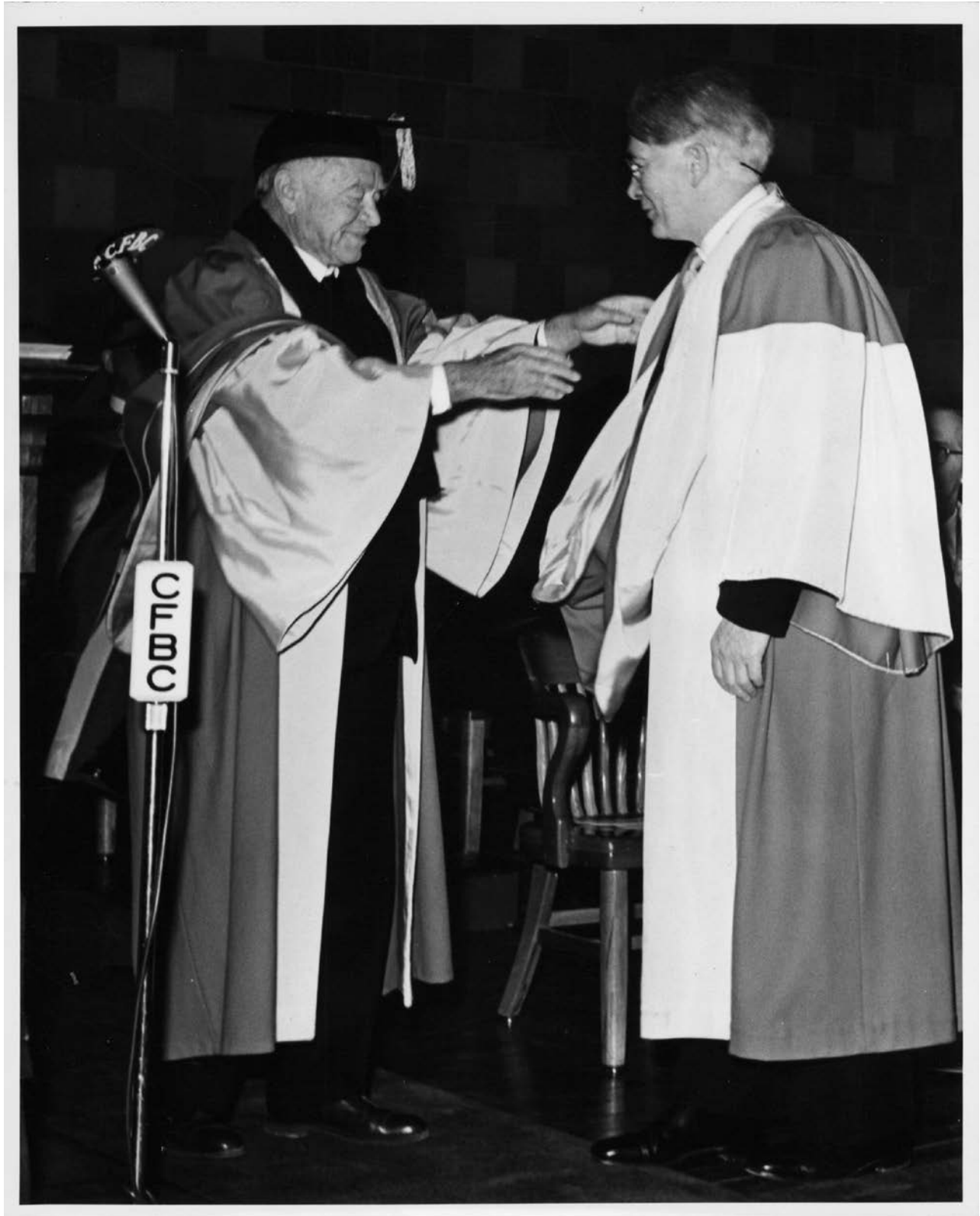
Figure 4. Brendan Bracken (R) receiving UNB honorary LL.D. degree from Chancellor Lord Beaverbrook, 27 October 1955 (Courtesy of University of New Brunswick Archives and Special Collections: UA PC 4 no. 5w, Archives and Special Collections, UNB Libraries).