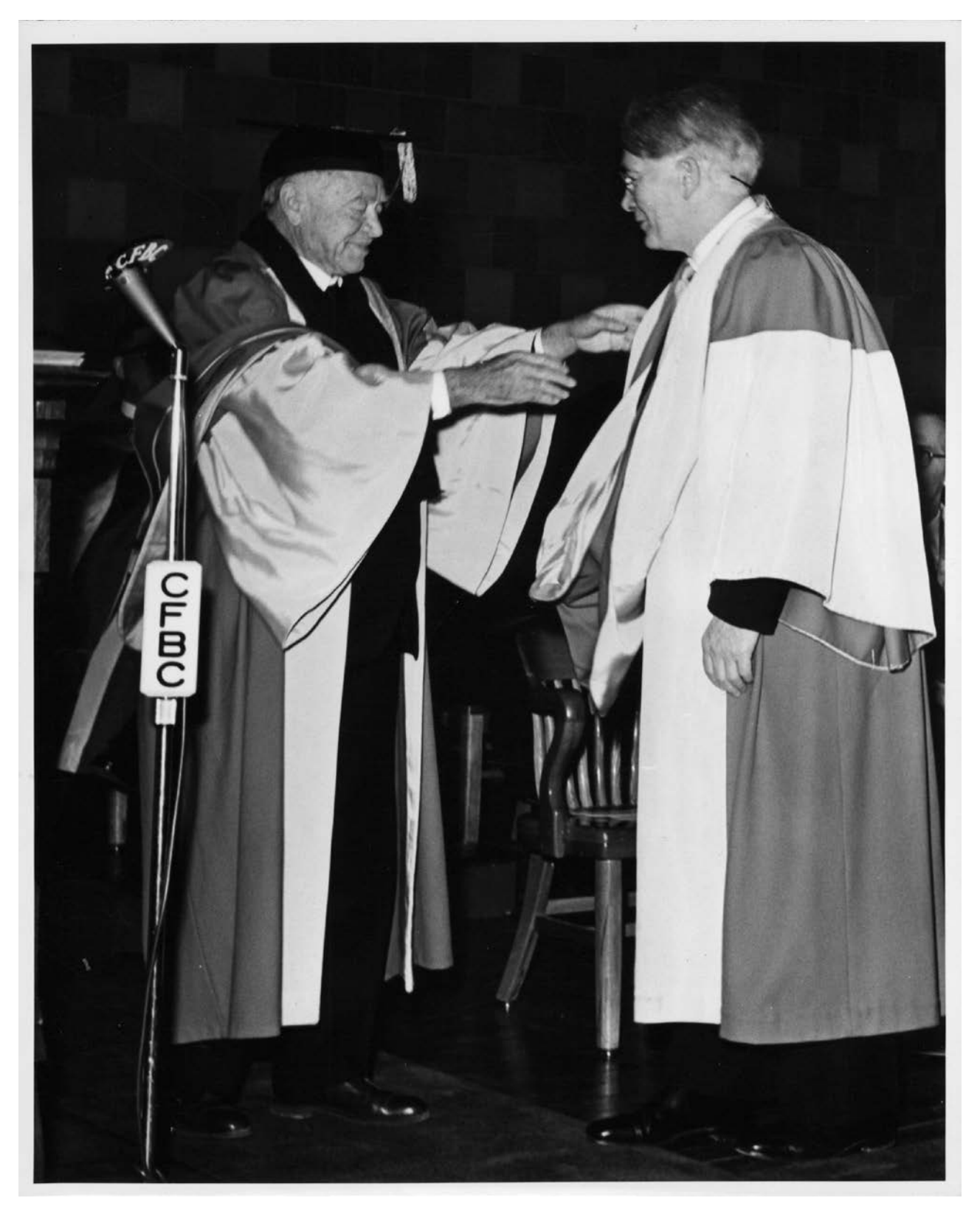
Figure 4. Brendan Bracken (R) receiving UNB honorary LL.D. degree from Chancellor Lord Beaverbrook, 27 October 1955 (Courtesy of University of New Brunswick Archives and Special Collections: UA PC 4 no. 5w, Archives and Special Collections, UNB Libraries).