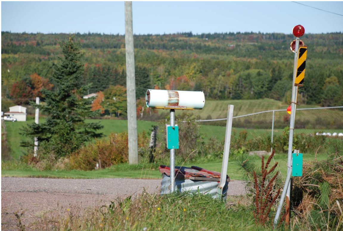
Figure 6. Adriana Kuiper, Untitled , digital photograph, 2008, used as postcard mailer for Capsule , 2008, Dalhousie University Art Gallery, Halifax, Nova Scotia. Photograph credit: Adriana Kuiper. Used with the permission of the artist.