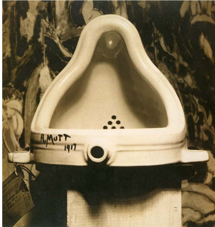
Figure 5. Alfred Stieglitz's photograph of Fountain , from The Blindman 2 , eds. Marcel Duchamp, Beatrice Wood, and Henri-Pierre Roché (New York, May 1917), 2.