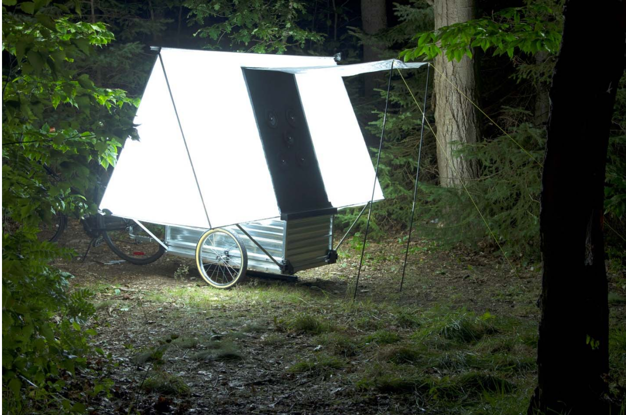
Figure 15. Adriana Kuiper and Ryan Suter, Night Tweeter , 2013 mixed media, installed in Art in the Open , Prince Edward Island. Collection of the artists. Used with permission of the artists.

The artists have since adapted this mobile artwork to another site in Halifax—the historic Citadel—for the 2014 Nocturne festival. Rather than rely on interspecies communication, they use the site to flash Morse code into the night. This long-defunct fortress, now a museum, falls into the category of a heterotopia, as it is centrally located in the city but still functions as a kind of no-place. Suter explained the connection between the installation and the piece as follows: “We’re playing with the Citadel as a signalling station. We’ve always been fascinated by the Citadel as a space in the city. It’s in the centre of town but definitely peripheral in how it functions” (Young). By relocating Night Tweeter from one site to another, the artists have transformed the work into a nomadic art object, “unhinged” and taking on new meanings according to its different locations. 22 Like a mobile phone, tweeting as a form of exchange of information links the new means of communication with more outdated modes of technology, such as the Morse code. Kwon comments on how these relational shifts in contemporary art have redirected our thinking about site specificity: