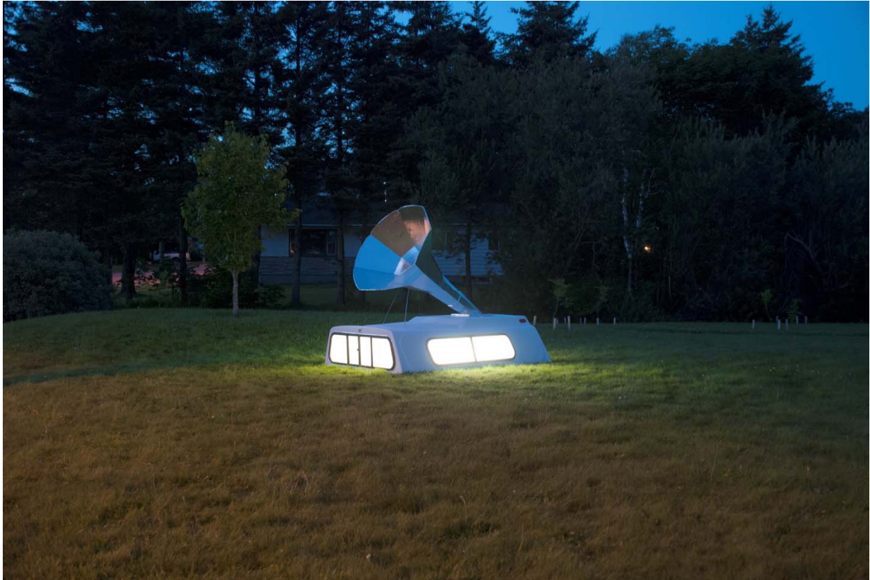
Figure 1. Adriana Kuiper and Ryan Suter, Wrong Road Again , mixed media, site-specific work, Sackville, New Brunswick, 2010. Used with the permission of the artists.

Here I go down that wrong road again Goin' back where I've already been Even knowin' where it will end Here I go down that wrong road again