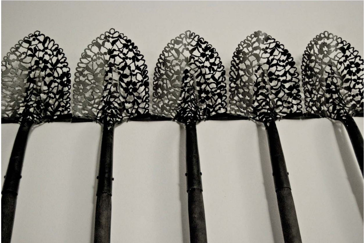
Figure 17. Cal Lane, 5 Shovels , plasma-cut steel shovels. Collection of Diane and David Waldman. Used with the permission of the artist.

on the concept of failure as a criterion for determining the avant-garde, does the rural readymade, in its relocation from the centre to the periphery, make us think anew about our relation with the everyday? With an increasing environmental consciousness that advances the local rather than the international, is there not something to be said for a regional art that proves more resilient than the promise of globalism? These questions only begin to address this ongoing debate by opening up the notion of the rural readymade as one critical response to these shifting, uncertain times.