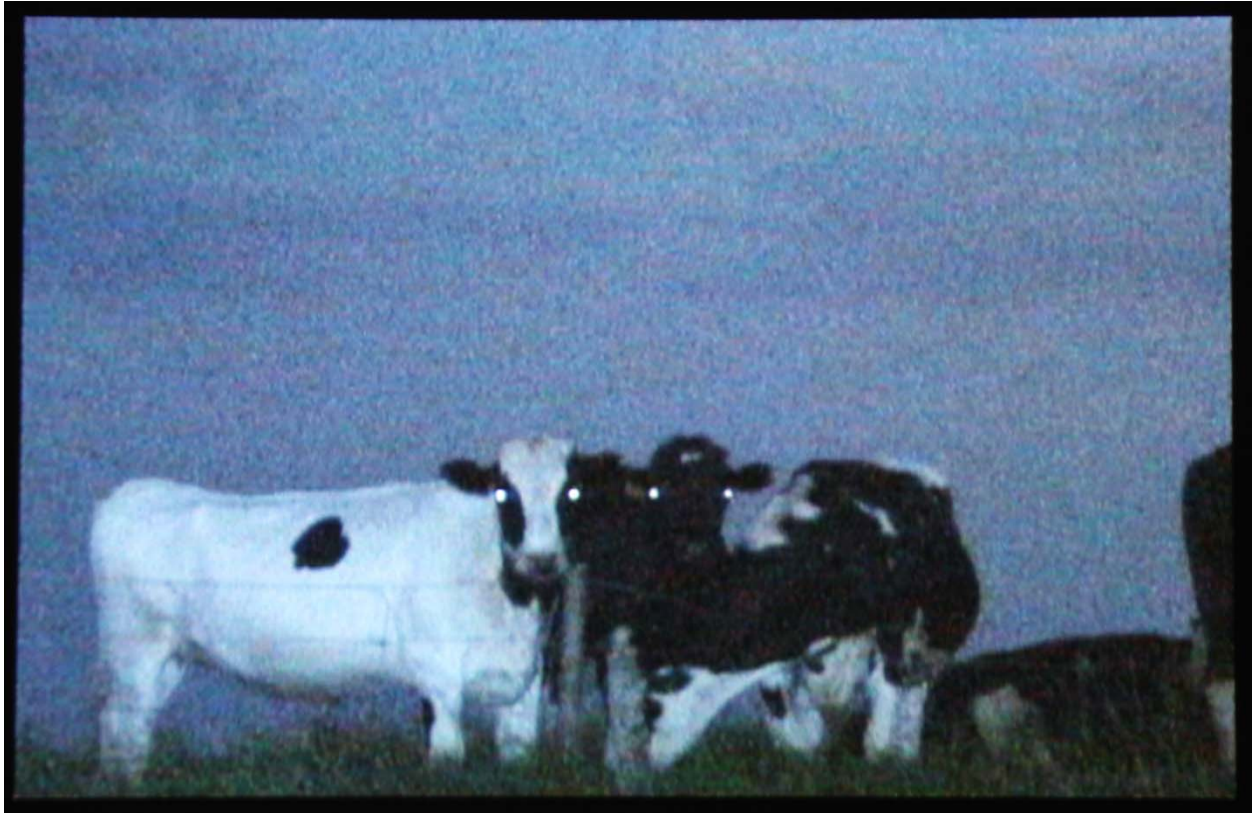
Figure 14. Ryan Suter, Accident Know , 2008, still from the audio/video installation OK Quoi , Media Festival, Struts Gallery and Faucet Media Arts Centre, Sackville, New Brunswick. Collection of the artist. Used with the permission of the artist.

These eerie effects of night are further explored by Kuiper and Suter in their recent collaboration Night Tweeter (Figure 15), a mobile sculpture that can be transported to various locations by bike. The sculpture/bike trailer includes a lid that opens and converts to a large speaker, as well as a white tent that folds out of the trailer. Recalling Wrong Road Again , the interior of the tent is illuminated, thus attracting insects to its interior. Not only does it become a provisional home for bugs, but it also allows for an interactive component where the insects' erratic movement is tracked by a computer that translates it into sound. The resulting "insect music" sounds like a discordant theremin, thus generating further sci-fi associations. Exhibited as part of the Charlottetown festival Art in the Open , Kuiper and Suter's Night Tweeter doubled as an improvised campground. Similar to Wrong Road Again , it is lit from within, but viewers cannot enter and are therefore unsure of what they are actually seeing. It appears as a hybrid camper and a nocturnal spectre. Suter explains that the work shares an affinity with Steven Spielberg's film Close Encounters of a Third Kind (1977), in which communication with extraterrestrials was the combined effect of musical notes with flashing coloured lights. In an interview, Suter observed that "this form of communication seems pre-lingual" and exploring further this idea was intriguing in his view (Young).