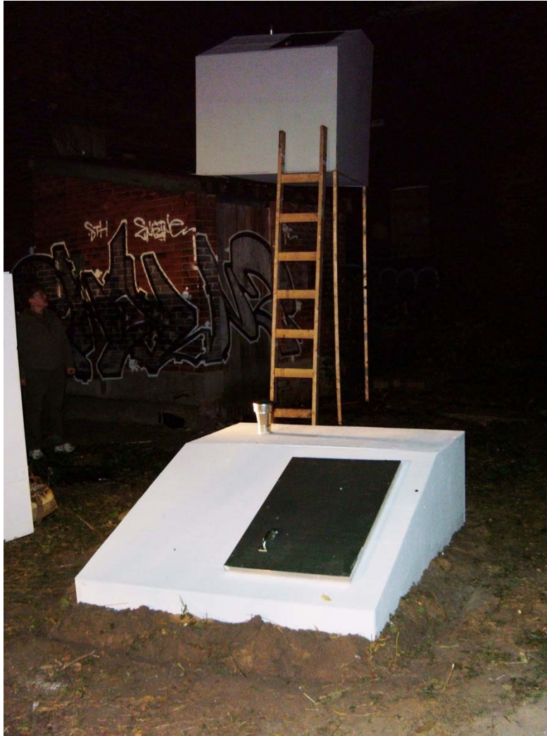
Figure 10. Adriana Kuiper, Metropolis , installation for Nuit Blanche , mixed media, 2007, Toronto, Ontario.

These weird constructed spaces, the purpose of which is to represent neither home nor actual shelter, bring to mind Michel Foucault's concept of heterotopias , as explored by the French philosopher in his 1984 essay entitled "Of Other Spaces." A heterotopia is a place that neither quite lives up to being a utopia, nor is it a dystopia: it is positioned instead as an in-between space where things seem different or strange. Foucault's notion of heterotopia refers to "something like counter-sites, a kind of effectively enacted utopia in which the real sites, all the other real sites that can be found within the culture, are simultaneously represented, contested, and inverted" (n. pag.). Sites such as retirement homes, psychiatric hospitals, and prisons are modern heterotopias of deviation. To Foucault, even gardens, cemeteries, museums, and libraries qualify as heterotopias of urban centres. He singles out their particularity as follows: