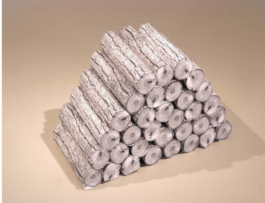
Figure 3. Adriana Kuiper, Photocopied Logs , Barrier Series , 2011, artist's collection. Photo credit: Adriana Kuiper. Used with the permission of the artist.

This idea of taking “real objects” and representing them in a new context is essential when considering how contemporary artists are revisiting the notion of the readymade. In Kuiper’s Photocopied Logs (Figure 3), she plays on the doppelgänger or double, reconstructing the object from photocopied images of logs, thus replicating its real status within its own absurd, material self. In this way, the ubiquitous rural New Brunswick log pile becomes the subject replicated through its own materiality—paper made from wood pulp—generating a photocopied image of itself. This is an excellent example of how the rural readymade operates within contemporary culture.