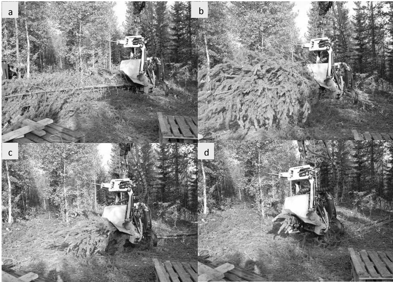
Figure 2. The compression and semi-debranching sequence of a bunch processed from the butt-end (a) to the top-end (d).

from 0–100, 0–250, and 0–500 kg (Table 1). In August 2006, 64 fresh bunches were made in total, 20 of which were randomly sampled and left in the stand for storage over winter, from August to June (~ 10 months) (Table 1). Experiments on fresh bunches and stored bunches were performed in August 2006 and June 2007, respectively. Bunches to be stored were placed on the ground in the stand at the felling site. After storage the proportions of their needles and fine branches that still remained were visually estimated according to a five-degree scale (0, 25, 50, 75, and 100%), and their color (green or brown) was also visually estimated.