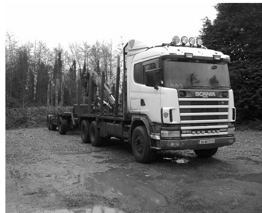
Figure 3. ~ Scania 124 (400) rigid + trailer + crane configuration.