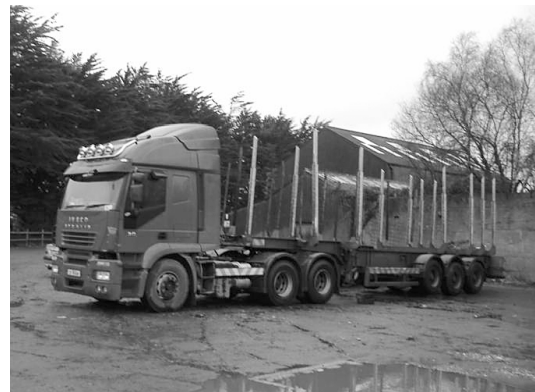
Figure 2. ~ Iveco Stralis 530 articulated configuration.

The Bluetree systems were fitted to two different axle configuration timber haulage trucks. The articulated truck was an Iveco Stralis 530 6*2 tractor unit with tri-axle road friendly air suspension flatbed trailer with a design gross vehicle weight (dgvw) equal to 44 t (Fig. 2). The Scania 124 (400) was a rigid (3 axle) + trailer (3 axle) + crane combination with an equivalent dgvw of 44 t (Fig. 3). Although both truck configurations have the same dgvw due to the 6-axle configuration, the articulated Iveco has a higher payload weight than the Scania rigid simply because this rigid + trailer + crane combination increases the tare weight and thus reduces the payload weight acceptable under weight legislation in Ireland. The on-board crane offers flexibility to the driver when loading and unloading timber. Also, some crane technologies allow the weighing of timber on each lift when loading, therefore enabling an approximate mea-