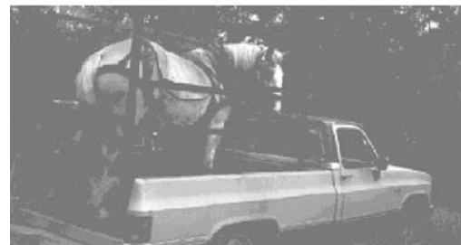
Figure 3. ~ Horse and a long stick cable loader truck.