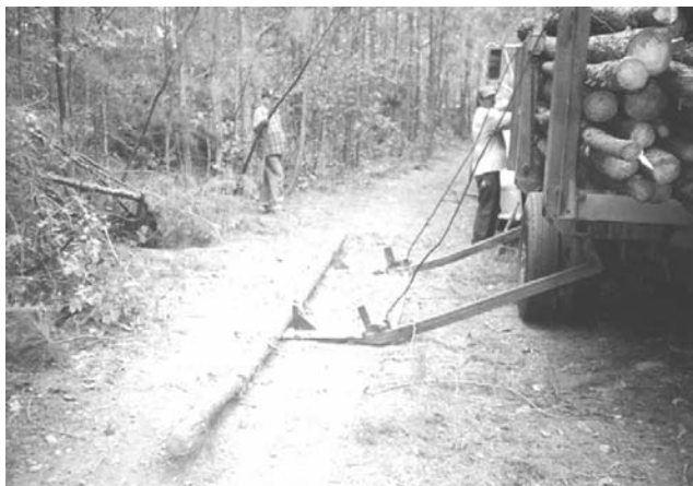
Figure 1. ~ A side loading truck.

Systematic grids, 48.8 by 36.6 m (160 by 120 ft), were laid out in each harvested area within a week after harvesting but before any rain event (Fig. 4). Beginning at one side of a permanent road where logging had been completed, a random starting point was selected for the corner of a study area. The grid covered both horse/mule skidding and machine travel areas. North-south base lines were installed every 12.2 m (40 ft)