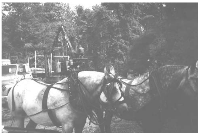
Figure 2. ~ Horses with knuckleboom loader.