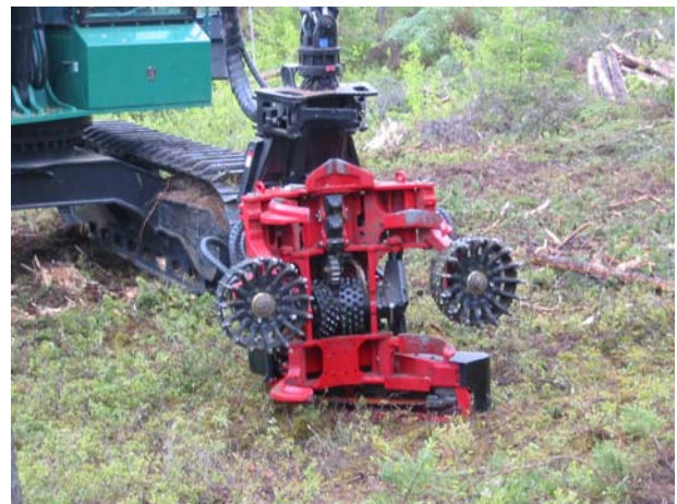
Figure 2. The Waratah HTH-470HD multi-stem head.

available in Canada is the Waratah HTH-470HD. The key elements that let this head efficiently process several stems at a time are the accumulator arms, which keep the cut stems vertical during felling; the four hydraulically or mechanically linked feed rollers, which prevent the stems from slipping during processing; and the extra-wide measuring wheel, which ensures constant contact with the tree bundles (Figure 2).