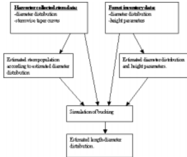
Figure 1. Possibilities of forming stand characteristics.

The stem was divided into 10-cm sections. For each section the thin-end diameter was obtained from the taper curve. Optimal bucking was performed by using dynamic programming [2] and bucking to value.