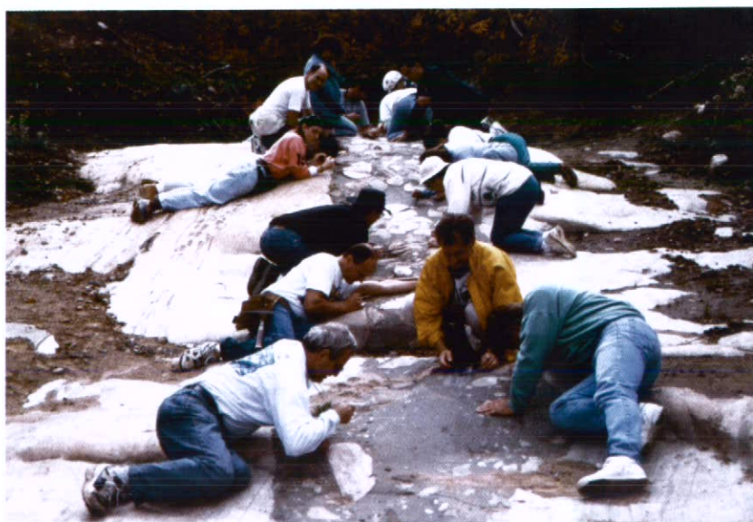
Figure 2 Papineau-Labelle Wildlife Reserve, Quebec: EdGEO fieldtrips provide teachers with a close-up look at local geology and instill in them an excitement and interest to share with their students.