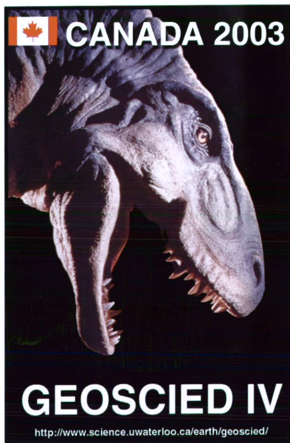
Figure 6 GeoSciEd IV, the Fourth International IGEO Conference, to be held in Calgary in 2003.

We gratefully acknowledge the organizations that have provided financial support to our programs. EdGEO is supported by the Canadian Geoscience Council, the Geological Association of Canada, the Canadian Society of Petroleum Geologists, Alcan, the Canadian Exploration Geophysical Society, the Canadian