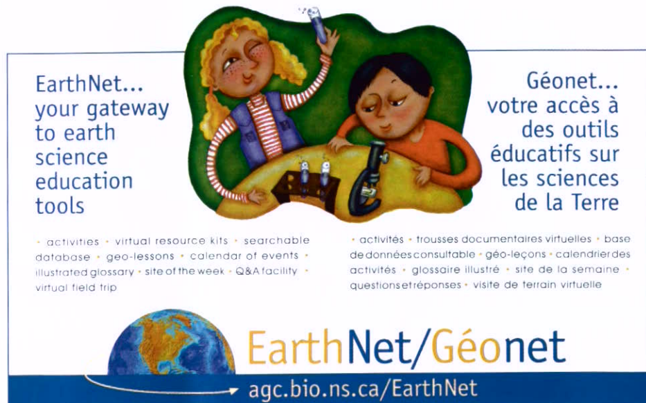
Figure 3 EarthNet, gateway to geoscience education resources.

The Geoscape Canada program, led by the Geological Survey of Canada in partnership with provincial and municipal agencies and educators, communicates practical earth science information to communities across Canada. The program operates on the premise that if we want to show Canadians the usefulness of earth science information, we must explain local geoscience issues that are relevant to them. Canadians want good water supplies, continued access to earth