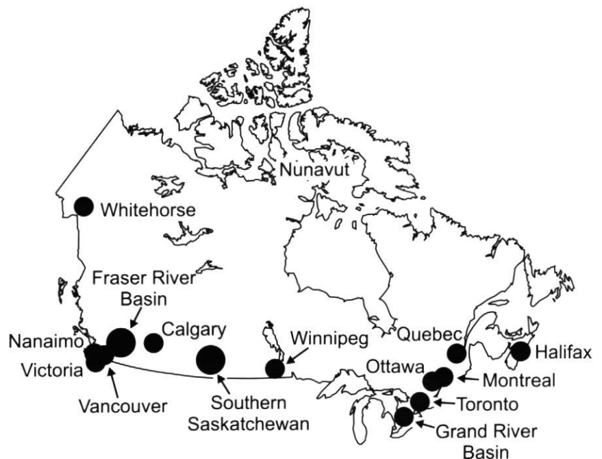
Figure 4 Locations of current Geoscape Canada projects.