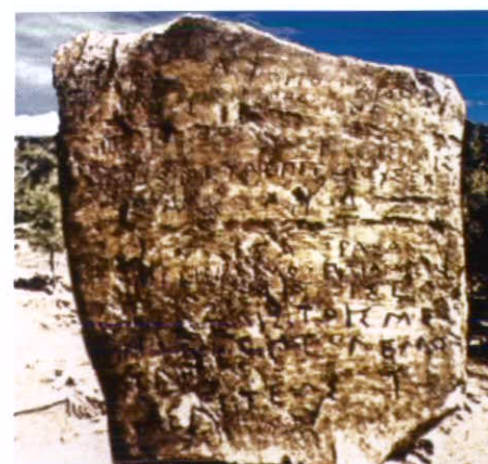
Figure 2 Slab from Ancient Laurium describing a mortgage of a mining property at Laurium. Acropolis Trustee, Museum of Ancient Agora, Athens, Greece.

Silver, won from cupellation of argentiferous galena at Laurium, south of Athens, where archeological evidence shows that mining began about 3500-3000 B.C., funded the Athenian fleet's victory over the Persian flotilla at Salamis in 480 B.C. (Kakavoyannis, 1988, p. 44-45; Raymond, 1984). The oldest known mining documents, also from Laurium, are marble slab inscriptions. One (Fig. 2), now in charge of the Acropolis Trustee, Museum of the Ancient Agora in Athens, concerns a mortgage on a mining property. Romans prospected and explored from Anatolia in the east to Cornwall in the northwest using many time-honoured methods such as surface stripping, pitting, trenching, and "divining," as well as currently used indicators. They are known to have "grubstaked" local prospectors who were sent to seek out mineralized outcroppings and auriferous placers. Gossan prospecting is not new! Gossans or "eisen huts" in later European terminology, were indicators not only to Romans but to their predecessor Egyptian and Phoenician explorers. This "live" gossan (Fig. 3) remains visible on outcrops above the now mined out, 20 million tons of ca. 4.0% Cu ore body at Mavrovouni in Cyprus. It must surely have attracted the attention of earliest prospectors, perhaps leading to the copper mining which, according to archeological evidence, had begun by