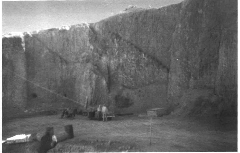
Figure 5 Old downward-accessing Roman stairway exposed in wall of modern pit, near Troulli, southeastern Cyprus.

none, only a worthless and unrecognized new element, nickel! Similar silver-rich veins were soon discovered at Konigsberg in Norway. Then, much later but dearer to Canadian hearts, also in 1899 in northern Ontario, prompting that first great claim-staking “rush” that truly initiated Canada’s mining industry, and