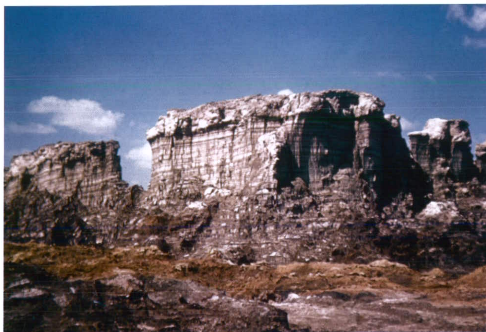
Figure 1 Bedded halite capped by bed of less soluble gypsum, forming "pillars" due to erosional dissolution, Danakil area, Eritrea (from Holwerda and Hutchinson, 1968).

misbehaved and turned into a pillar of salt, presumably like those in Eritrea (Fig. 1). Copper, readily identified from its colours in oxidized outcrops, was smelted as early as 5000 B.C., at a thoroughly studied archeological site at Timna in the Israel Negev near Eilat (Poss, 1975, plate 48) where copper has also been mined during recent decades. Copper was combined with tin, won and smelted from placer cassiterite, to make the vessels and tools of the Bronze Age throughout the near- and mid-eastern world in the 4th and 3rd pre-Christian millennia, but the geographic source of this abundant tin remains uncertain and conjectural, one of archeology's unsolved enigmas (Raymond, 1984, p. 33). Gold, then as now the most highly prized of all, and probably the first found, initially went almost exclusively to the powerful and affluent to signify wealth and power, and for decorative and religious purposes. Gold's use in coinage developed somewhat later, about 700 B.C., in Lydia. It was widely won from placers and lodes. The ancient Greek legend of Jason and the Golden Fleece is almost certainly an allegorical account of a gold prospecting expedition to the eastern Black Sea coast, where fine gold was apparently won by washing auriferous stream sediment through lamb's fleece (Bernstein, 2000, p. 15-16, 30).