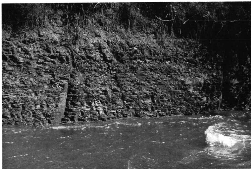
Figure 4 Jointed Whitby Formation shale exposed along the Rouge River Valley (Fig. 1, inset).