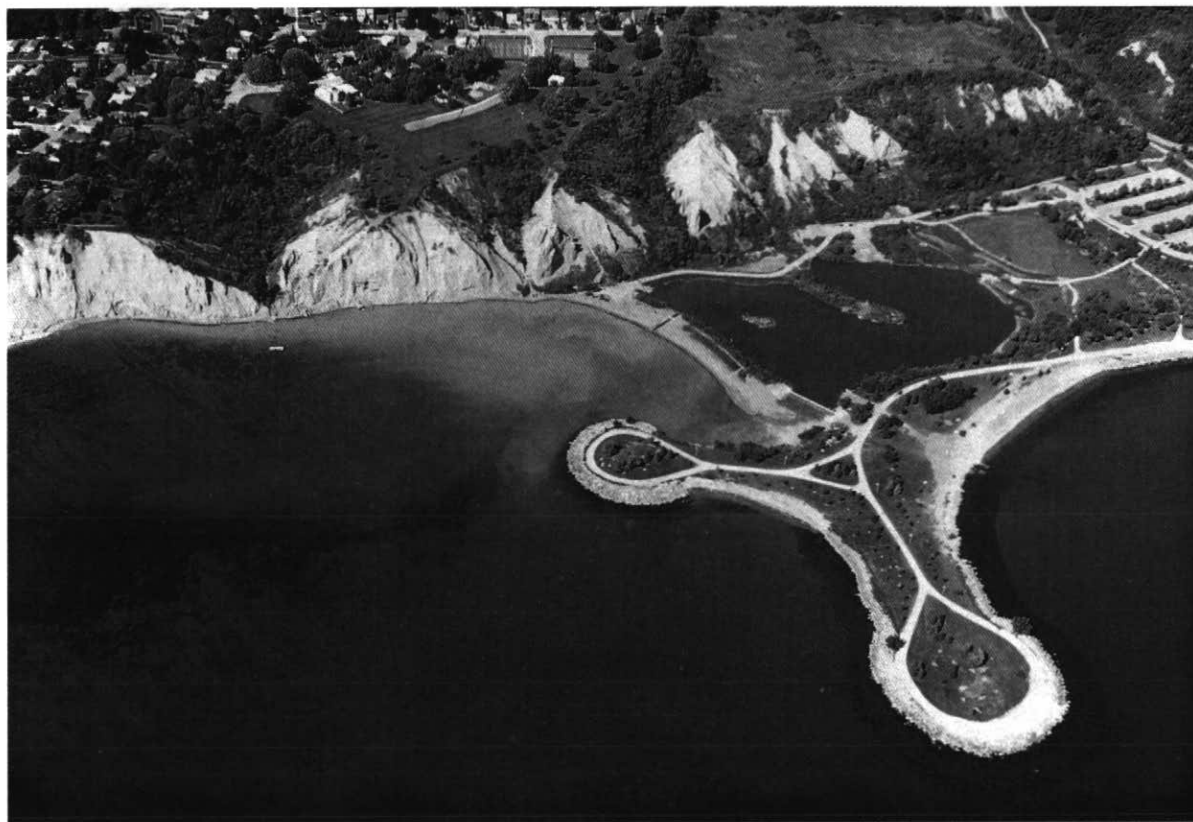
Figure 3 Aerial view of Bluffers Park in September, 1997. Beneath the water level, prominent joints in Pleistocene sediment are expressed as closely spaced black lines perpendicular and parallel to the cliffs to the left of the marina. Joint traces have been widened by waves and accentuated by washed-in cobbles, thus forming dark-coloured lines on the lake floor. The orientation of these joints (Fig. 1B) agrees with the orientation of joints in bedrock (Fig. 1A).

The data presented here indicate a close correspondence between joint orientation in Paleozoic bedrock, those in overlying Pleistocene sediment and the trend of the cliffed shoreline of Lake Ontario and associated cliffs in the Scarborough Bluffs area. This finding is not unexpected. Eyles and Scheidegger (1995) and Eyles et al. (1997) showed that neotectonic joints in bedrock exert a major control on the orientation of both modern rivers, cut into Pleistocene sediments, and buried "preglacial" bedrock channels in southern and southwestern Ontario. They